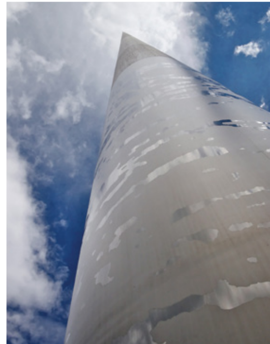
The Dublin Spire – a stunning example of our surface texturing technique showing the versatility of controlled shot peening

Tailoring our services to meet your needs