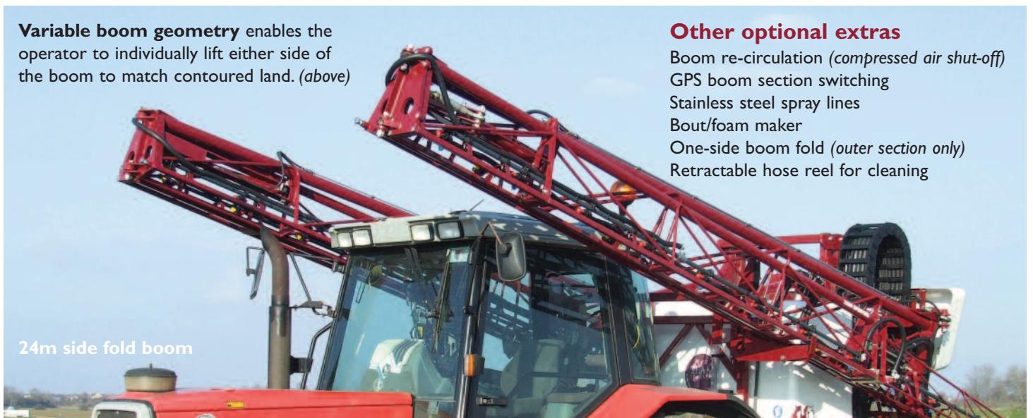
24m side fold boom