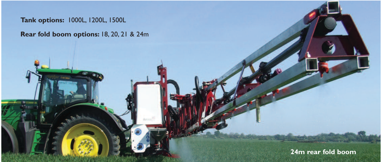
24m rear fold boom

Rear fold boom options: 18, 20, 21 & 24m