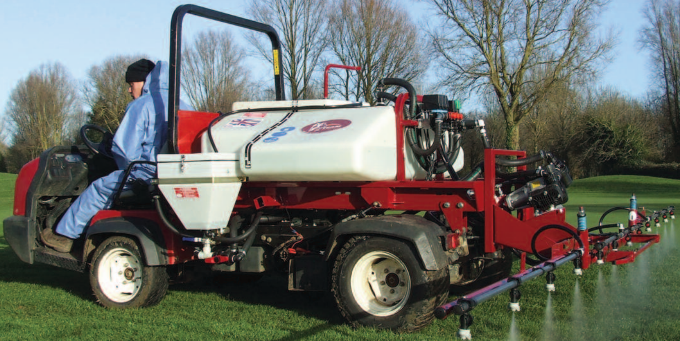
600L tank with 6m boom

British designed and built for British groundcare specialists