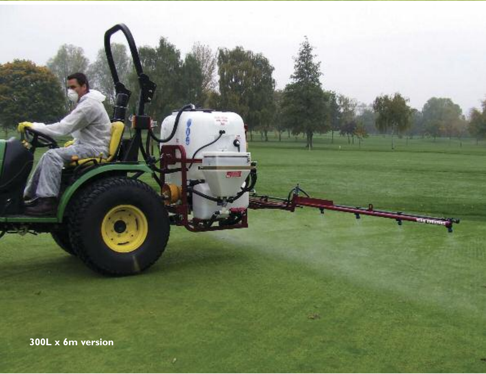
300L x 6m version

British designed and built for British groundcare specialists