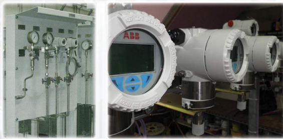
Instrument Panels & Enclosures

Instrument Enclosures, Control Panels, Analytical Shelters, Sampling Systems and ATEX Enclosures are all within our scope of supply and expertise. In addition, Control Systems and some small Skid Packages can be offered to meet customers' requirements.