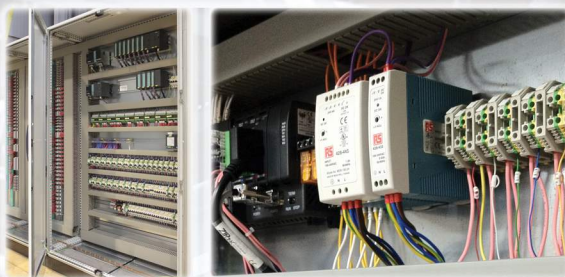
Control Systems & Software