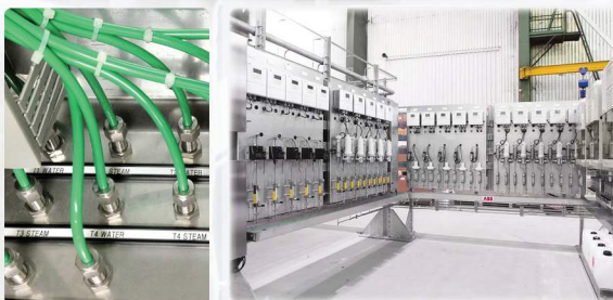
Analytical Shelters & Sampling Systems