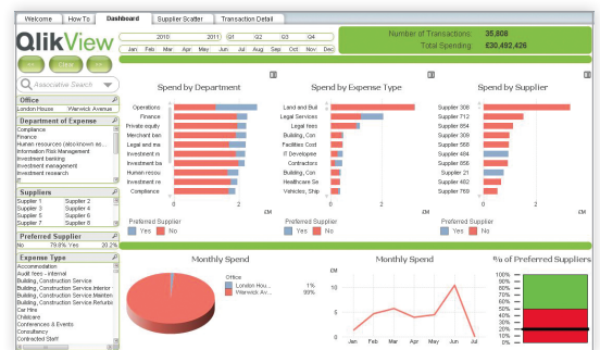
Example: supplier spend analysis app

“ QlikView will show our managers who may be buying with 1,000 suppliers how they could be working with just 100. ”