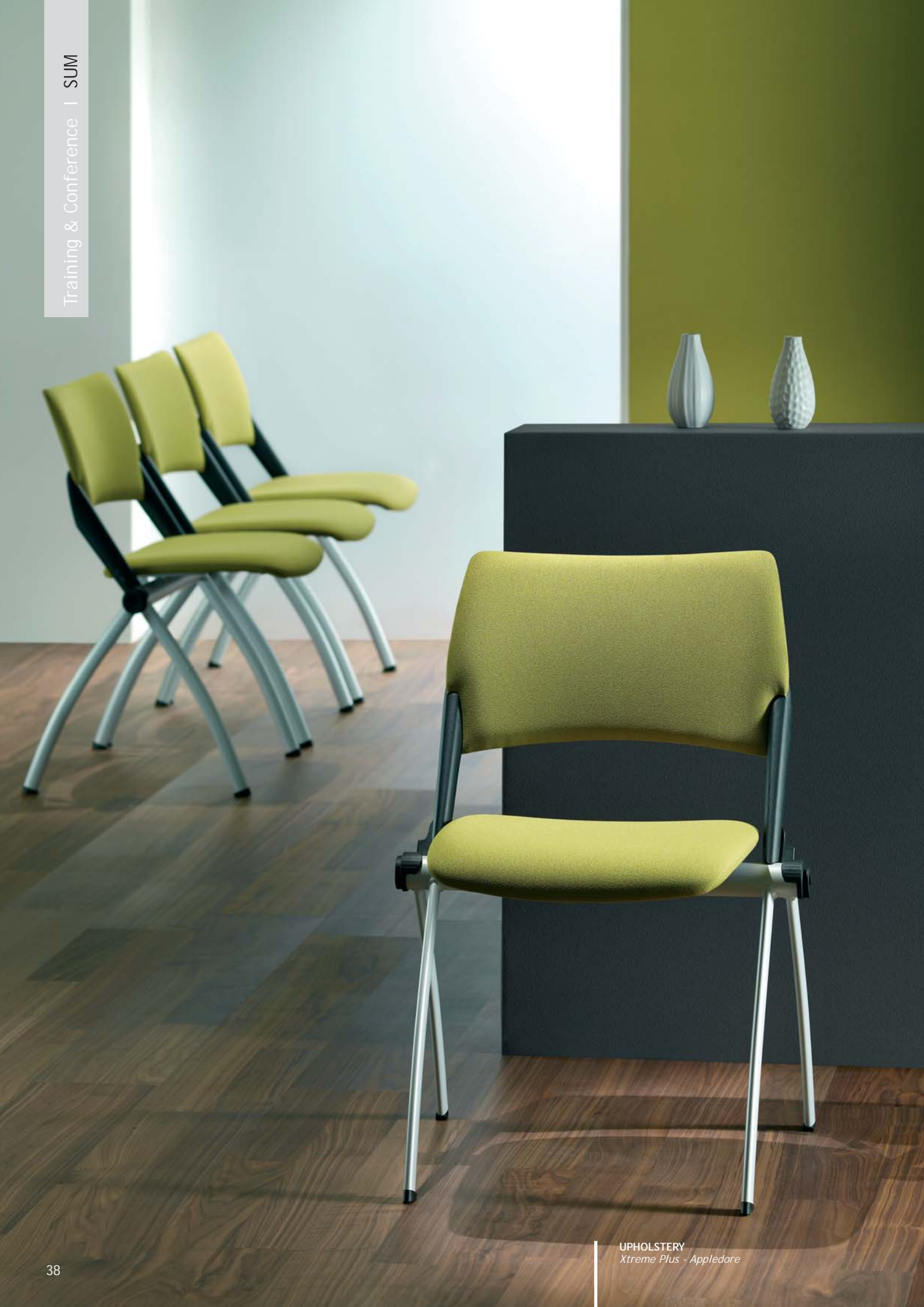
UPHOLSTERY Xtreme Plus - Appledore