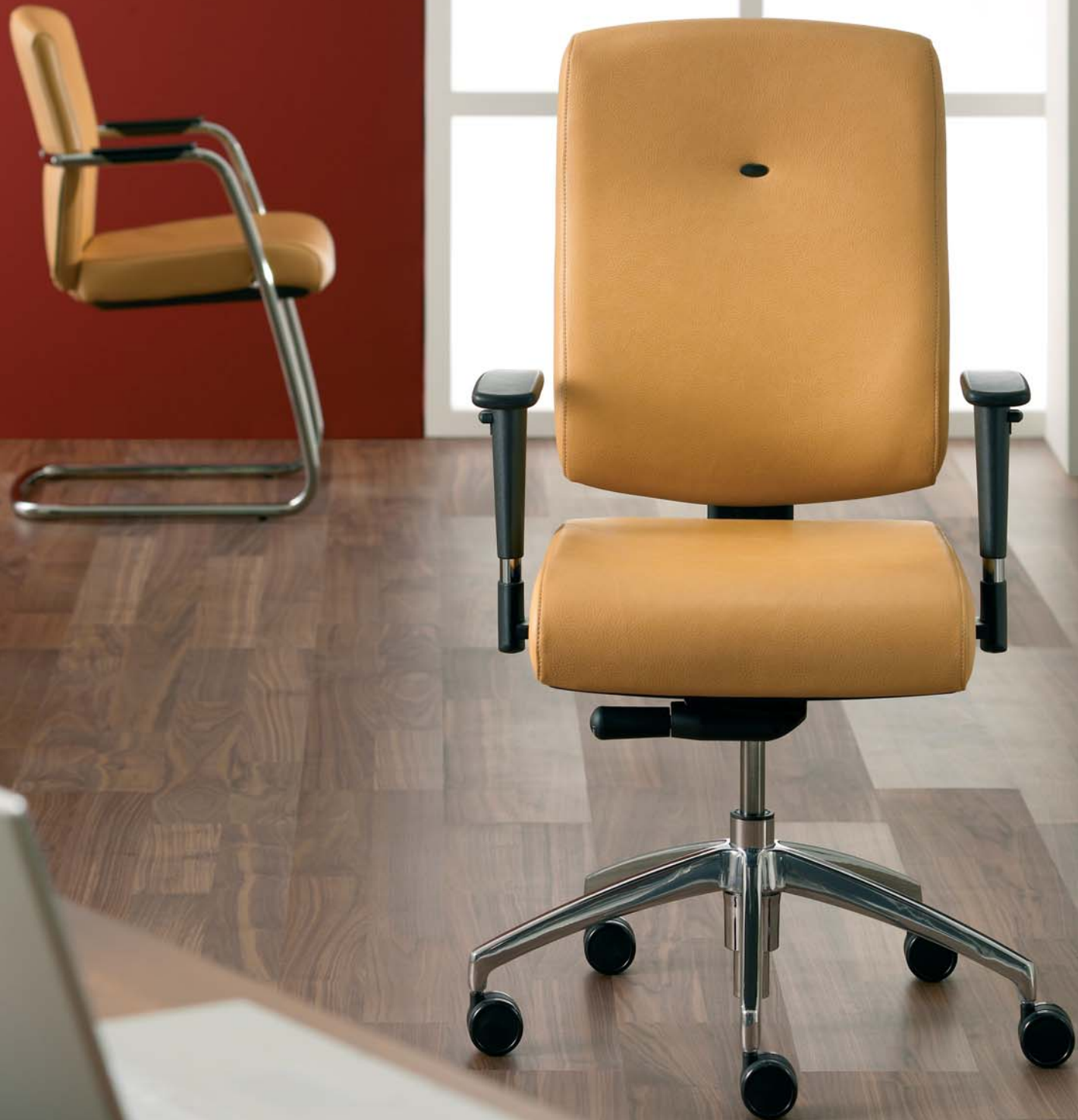
UPHOLSTERY Delta - Beige