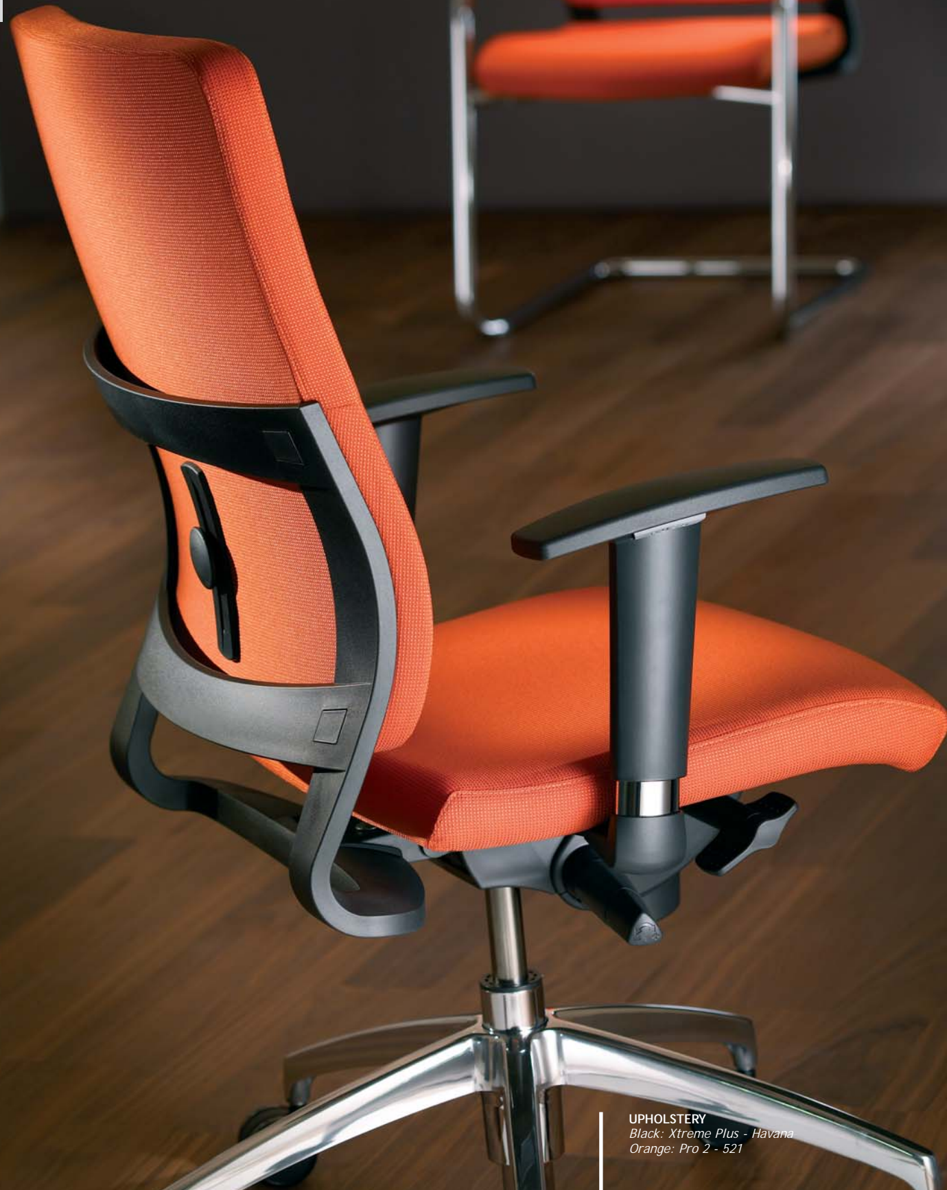
UPHOLSTERY Black: Xtreme Plus - Havana Orange: Pro 2 - 521