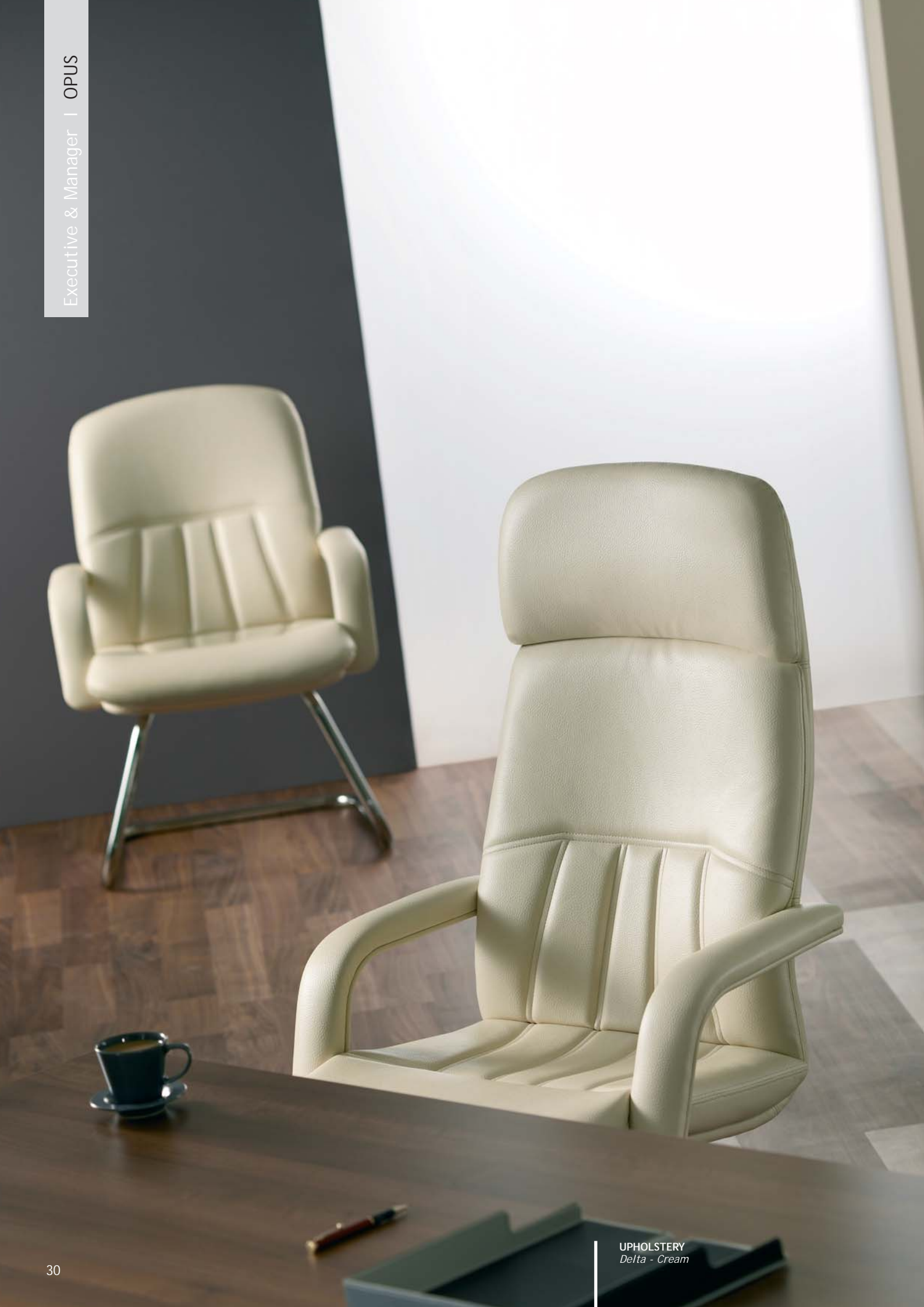
UPHOLSTERY Delta - Cream