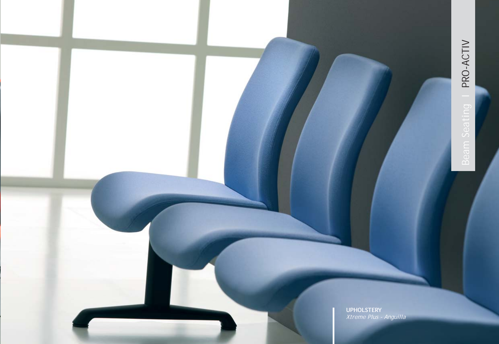
UPHOLSTERY Xtreme Plus - Anguilla

Offering many permutations of seats and tables on a free standing beam, public areas and waiting rooms are well catered for by Luna.