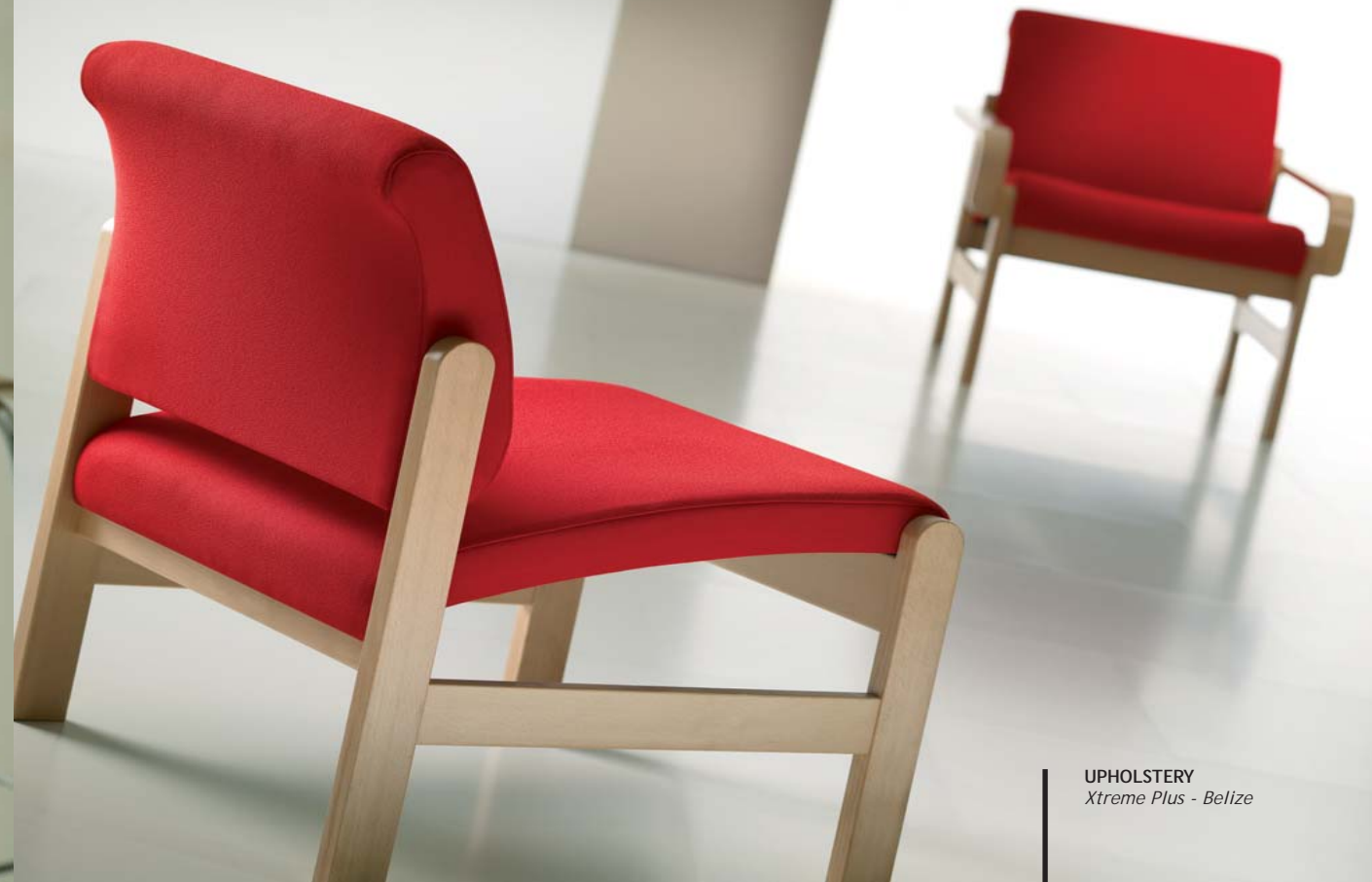
UPHOLSTERY Xtreme Plus - Belize

Bistro provides a range of different shapes, heights and styles for communal and cafeteria areas.