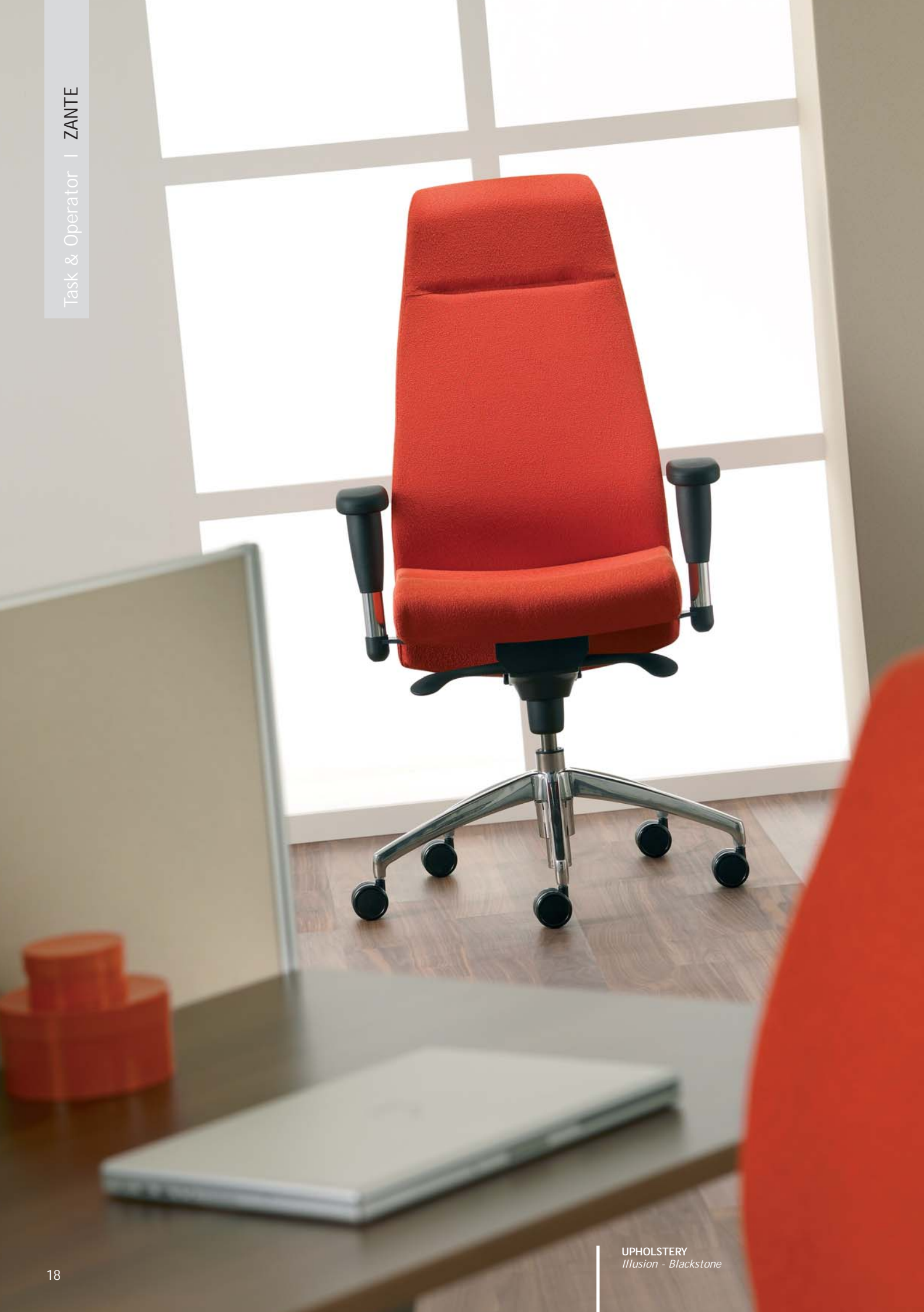
UPHOLSTERY Illusion - Blackstone