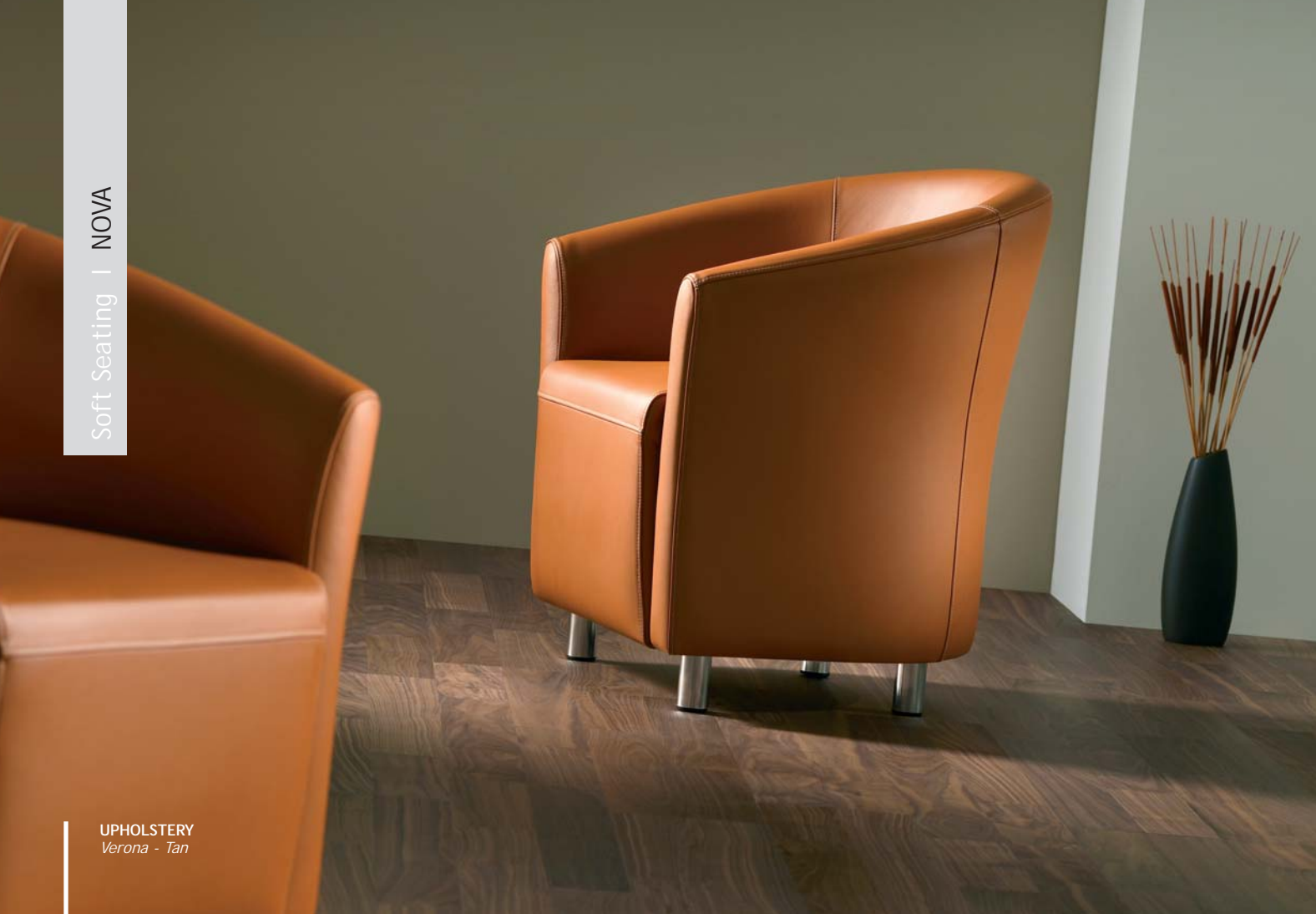
UPHOLSTERY Verona - Tan