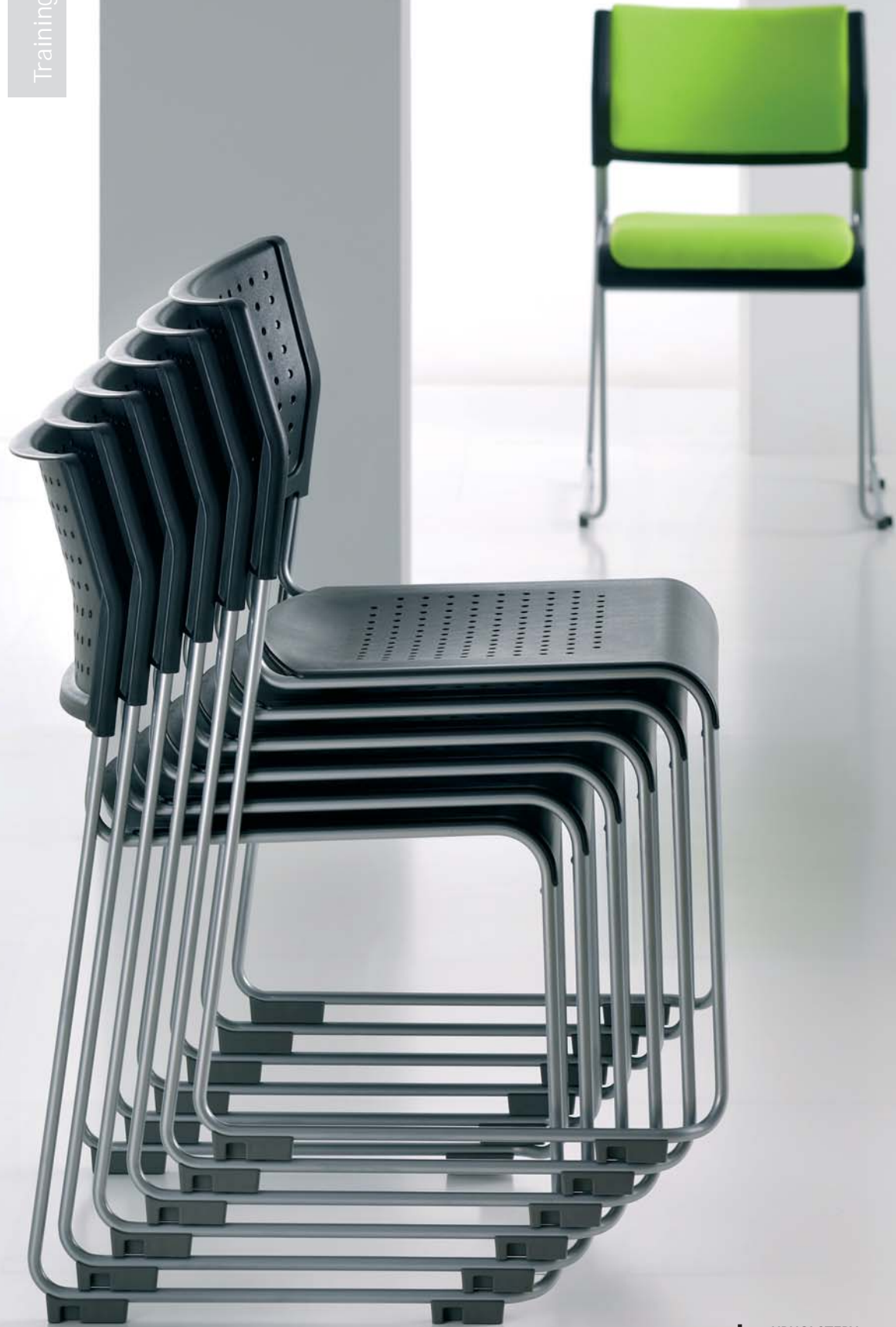
UPHOLSTERY Xtreme Plus - Madura