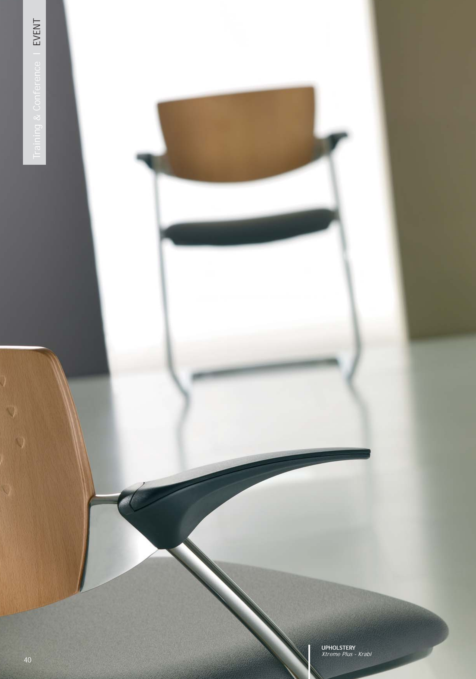
UPHOLSTERY Xtreme Plus - Krabi