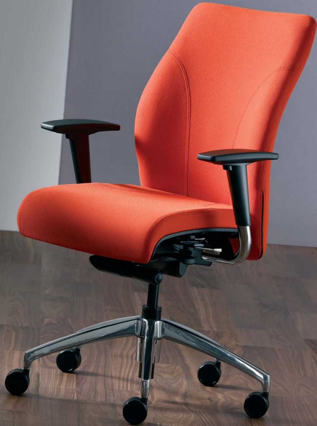
UPHOLSTERY Xtreme Plus - Tortuga