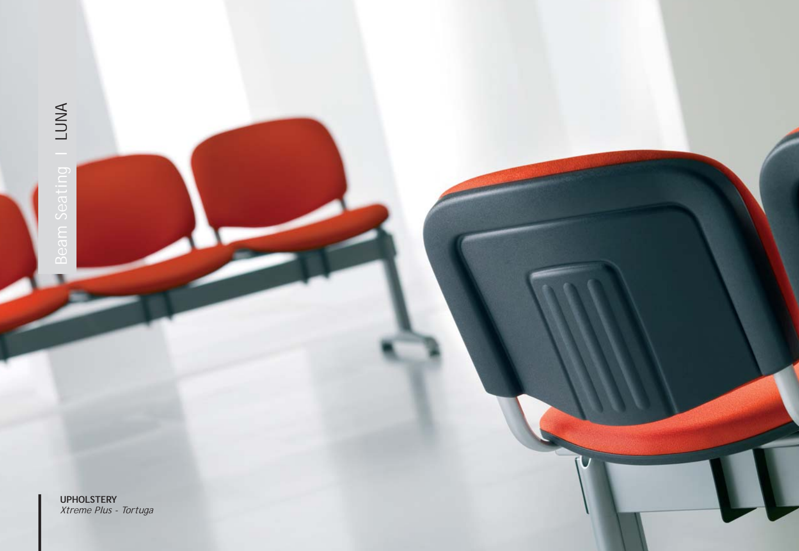
UPHOLSTERY Xtreme Plus - Tortuga