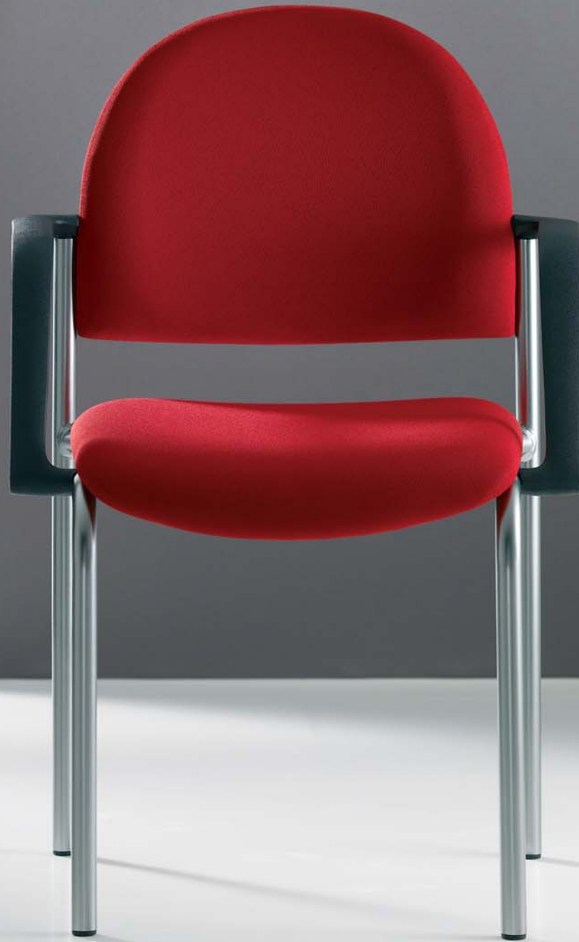
UPHOLSTERY Xtreme Plus - Calypso