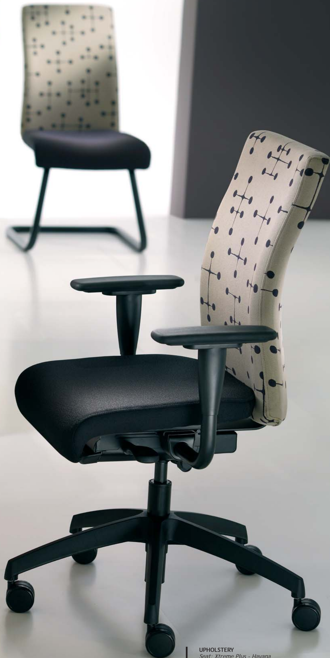
UPHOLSTERY Seat: Xtreme Plus - Havana Back: Dot Pattern - 002