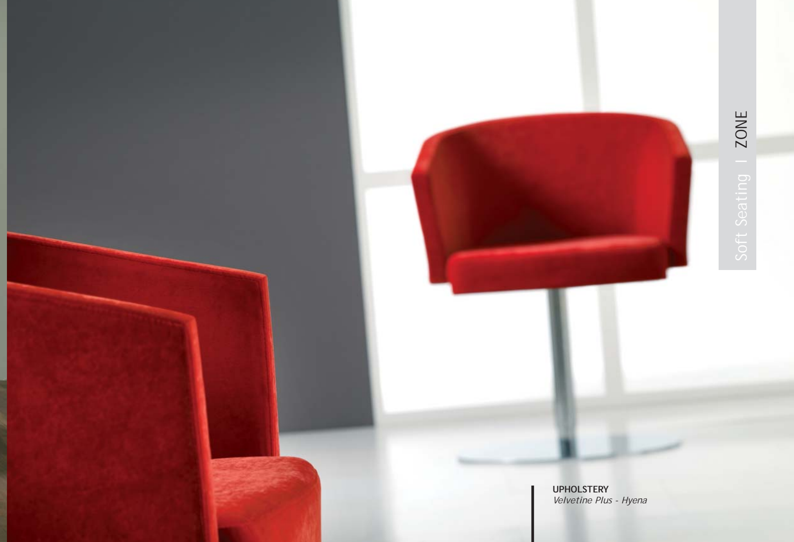
UPHOLSTERY Velvetine Plus - Hyena

Contemporary styling combined with tailored upholstery techniques produces tub chairs with elegance and choice to suit individual taste and corporate environments.