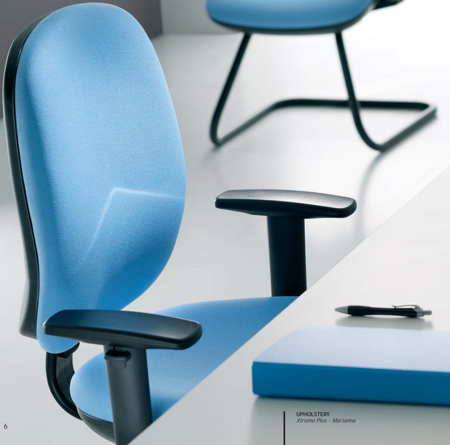
UPHOLSTERY Xtreme Plus - Marianna