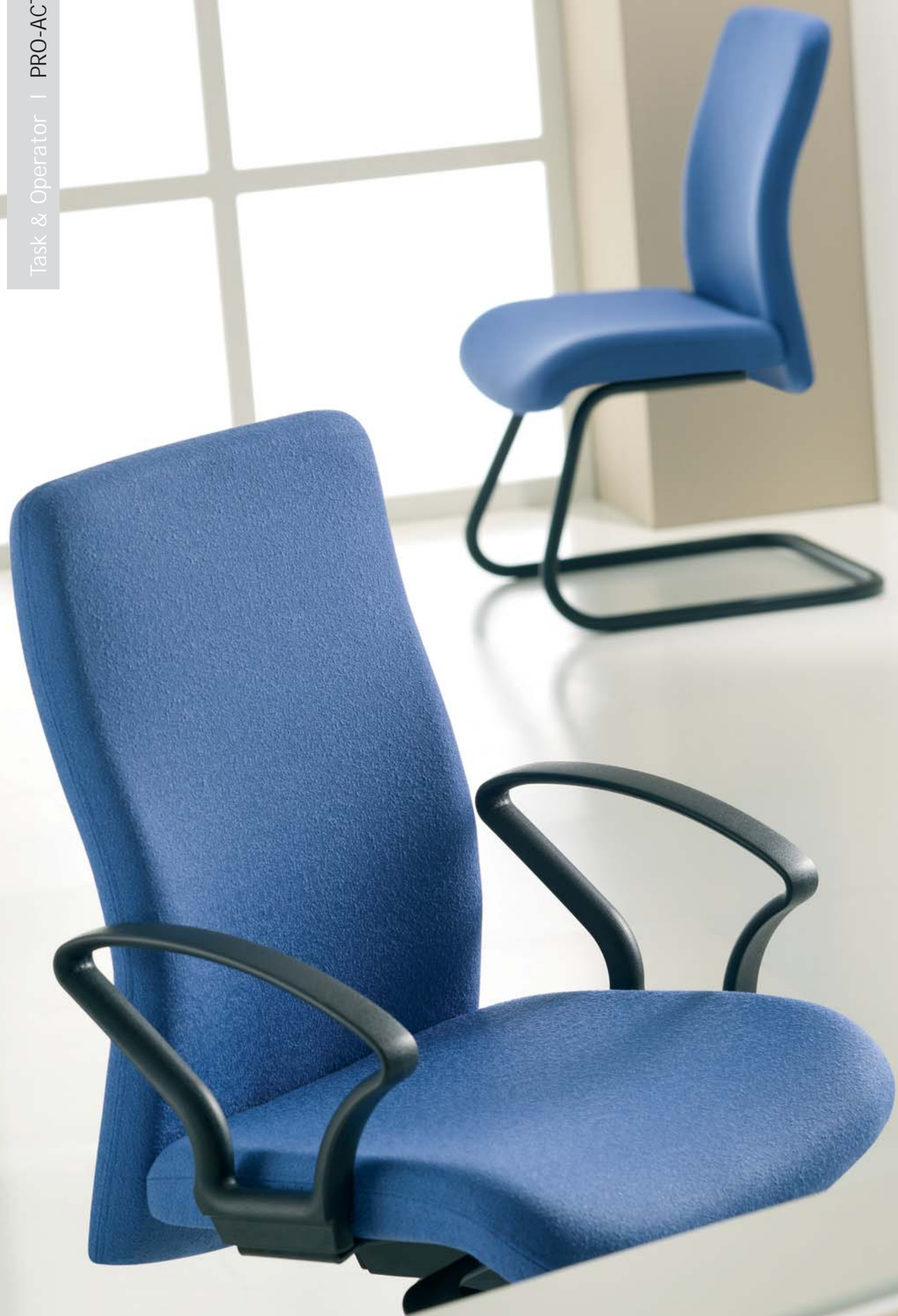
UPHOLSTERY Illusion - Chispa