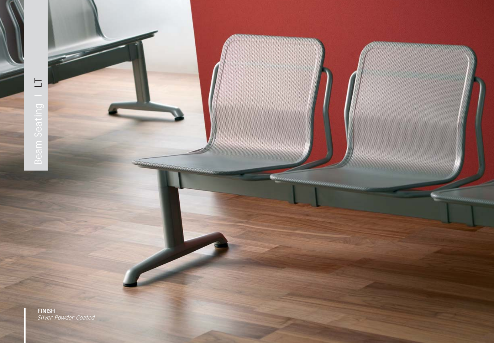
FINISH Silver Powder Coated