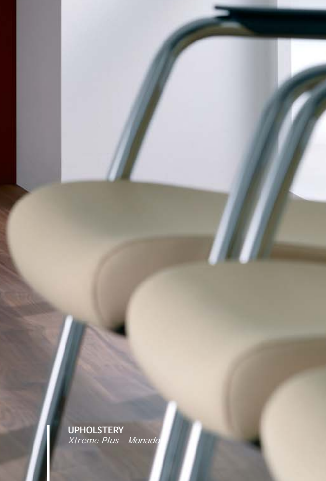
UPHOLSTERY Xtreme Plus - Monaco