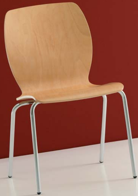
FINISH Wooden Shell