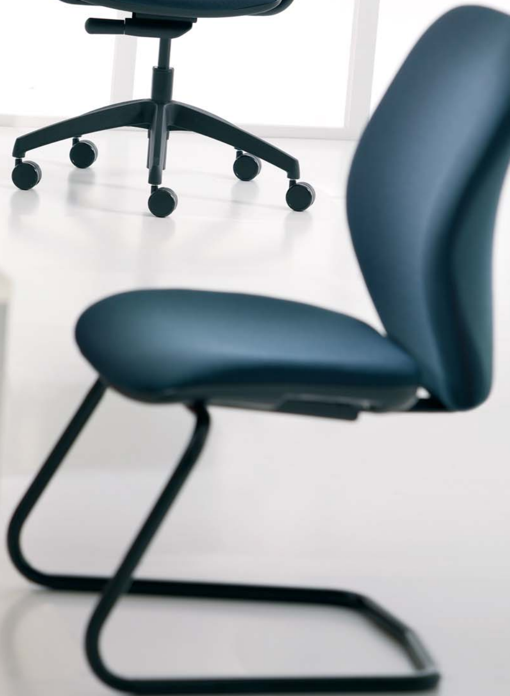
UPHOLSTERY Seat: Xtreme Plus - Costa Back: Eton Stripe