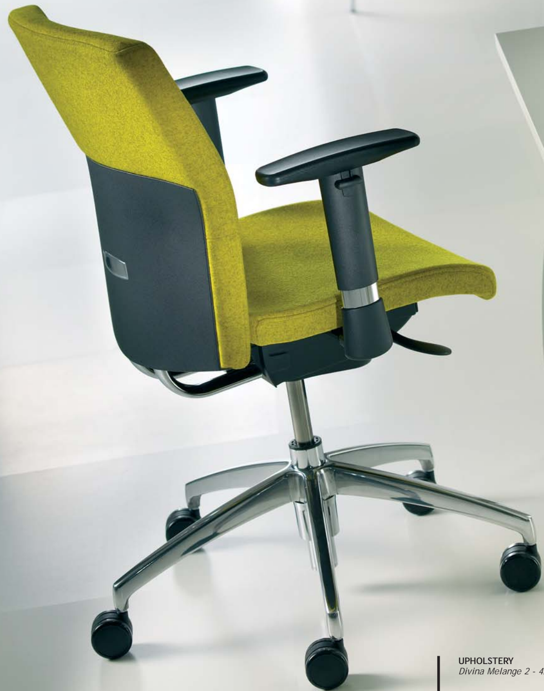
UPHOLSTERY Divina Melange 2 - 421