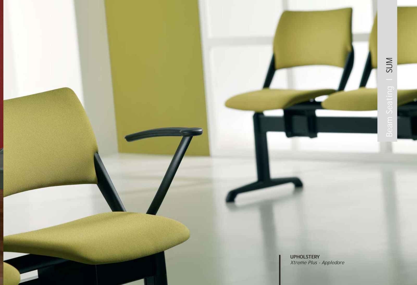
UPHOLSTERY Xtreme Plus - Appledore

LT is a metal mesh seating solution ideal for public areas.