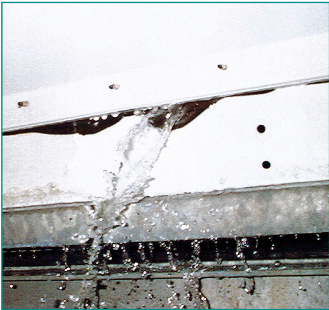
Typical sealant failure