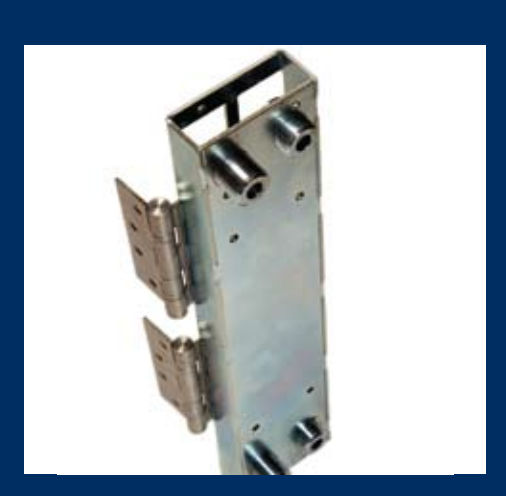
Hinge Chassis System