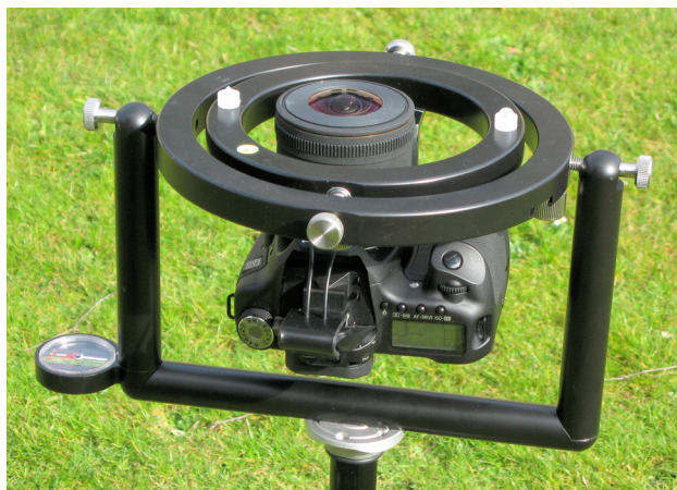
Digital SLR camera in the SLM9 Self-levelling Mount