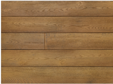
Enhanced Grain - Coppered Oak

Colours include Smoked Oak, Coppered Oak, Golden Oak, Limed Oak, Jarrah and Charred (Enhanced Grain), Driftwood, Vintage and Carbonised Embered (Weathered).