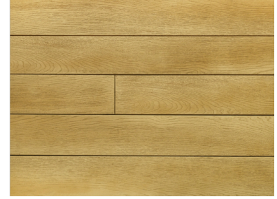
Enhanced Grain - Golden Oak