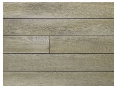
Enhanced Grain - Smoked Oak