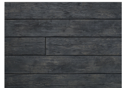
Weathered - Embered

Enhanced Grain - 176 x 32 x 3600mm (1.54 boards per m 2 )