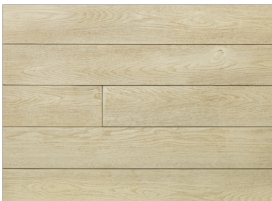
Enhanced Grain - Limed Oak