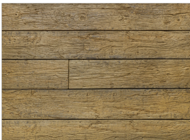
Weathered - Vintage