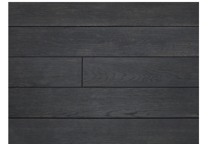
Enhanced Grain - Charred