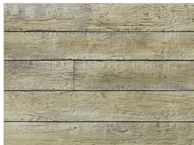
Weathered - Driftwood