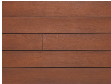
Enhanced Grain - Jarrah