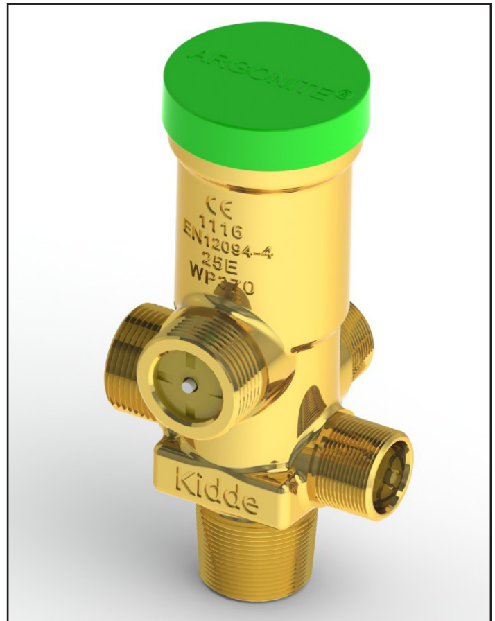
New ARGONITE® C60 Controlled Flow valve

The ARGONITE® C60 System is a major advance on ordinary inert gas fire suppression systems. It uses an innovative cylinder valve assembly that significantly reduces the peak mass flow, releasing the gas at a lower and more controlled flow rate throughout the discharge.