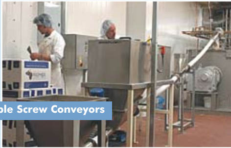
Flexible Screw Conveyors

Economical and versatile conveyors for a multitude of products and applications. Only one moving part, low maintenance, easy to clean, consistent, gentle feed. Optional mobile base.