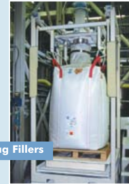
Bulk Bag Fillers

Positive pressure and vacuum conveying systems designed to pharmaceutical and food standards, easy to clean and offering minimal product degradation. Ideal for torturous routes. Vacuum systems can have suction wands to empty open top bins and kegs.