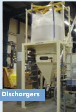
Bulk Bag Dischargers

Ideal for vertical or angled conveying of a wide variety of products, even friable, fibrous or cohesive ones. High throughputs and total batch transfer.