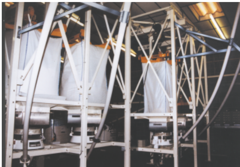
Bulk bag dischargers with integral hoists, sieves, and flexible screw conveyors