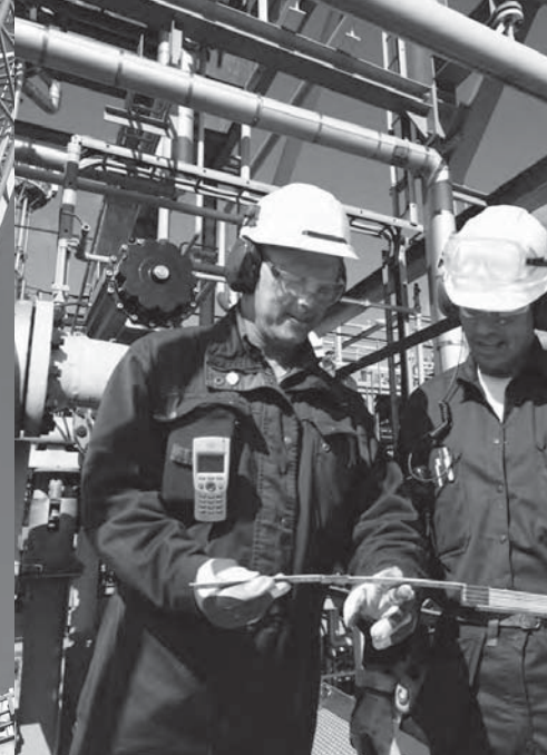
A typical leak detection control plant