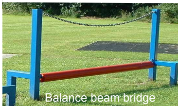
Balance beam bridge