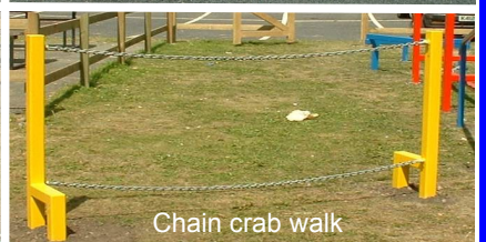
Chain crab walk