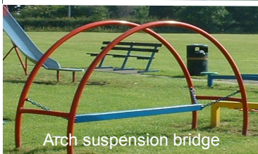
Arch suspension bridge