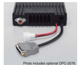
Photo includes optional OPC-2078.

The optional ACC cable allows you to connect with various external devices to control audio output, modulated signal input, remote channel control, horn honk and many more functions. OPC-1939 is a D-SUB 15-pin type and OPC-2078 is a D-SUB 25-pin type.