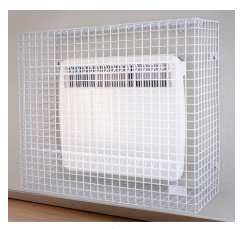
How to Measure for a Panel Heater Guard

Measuring for panel heater guards is not as hard as you would think. Just follow our step by step instructions and we will do the rest.