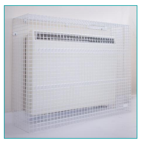
How to Measure for a Storage Heater Guard

Measuring for storage heater guards is not as hard as you would think. Just follow our step by step instructions and we will do the rest.