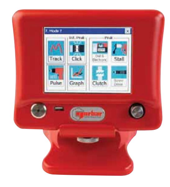
T-Box™ torque and angle measuring instrument

T-Box™ is the latest Norbar measuring instrument, with its TDMS software, designed to store trend data and assist you in setting appropriate recalibration or maintenance intervals.