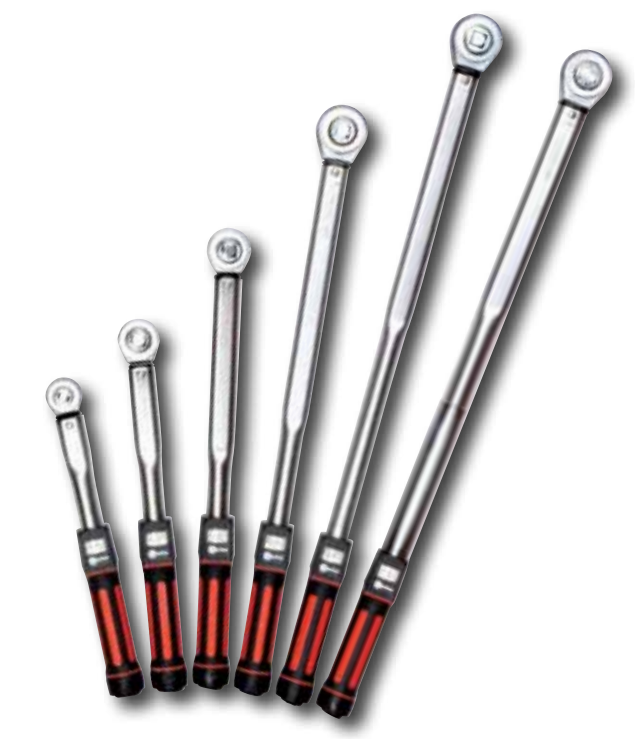
Professional torque wrench range

Throughout Norbar's 70 year history we have been closely involved with the power generation industry: from coal fuelled plant through to highly safety critical areas of nuclear plant and, more recently, extensive involvement in the wind