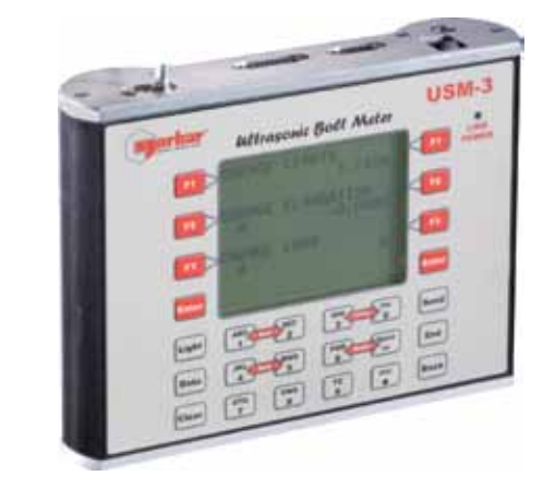
USM-3 Ultrasonic Bolt Meter

The diverse needs of the power generation industry, from nuclear to wind, mean that Norbar's standard range of products are not always suitable. This is particularly true with regard to difficult to reach bolts, for example, on wind turbines or where an even higher degree of accuracy and verification is required as in the nuclear industry. Norbar therefore offers an Engineer to Order service that spans a range from modified reaction arms through to completely one off tools or measurement systems.