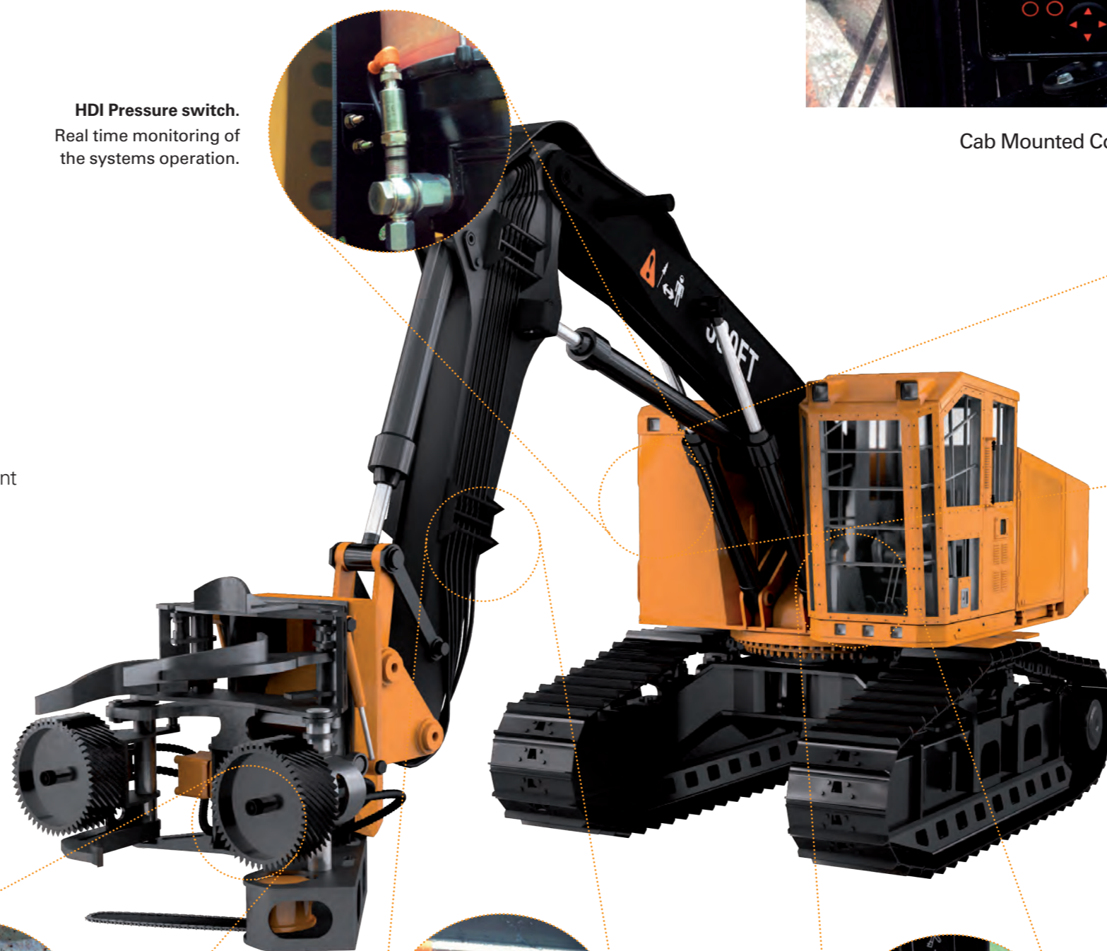
Cab Mounted Control Panel

HDI Pressure switch. Real time monitoring of the systems operation.