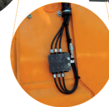
Stock Head Block