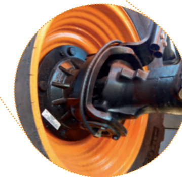
Lower King Pins