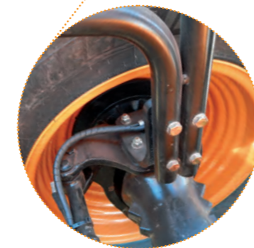
Upper King Pins