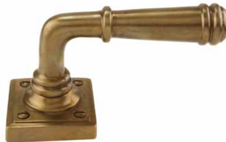
Light Patina Bronze