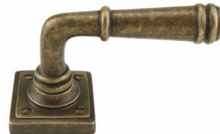
Satin Marbled Bronze