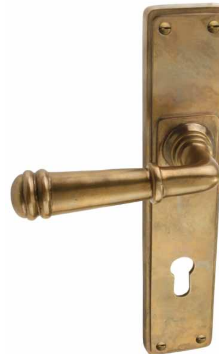
718 Ribbed Lever Handle Plate, latch, lock 252mm x 50mm, handle 115mm available in 70mm & 92mm ctrs (un-sprung) 72mm ctrs (sprung) Available in all finishes