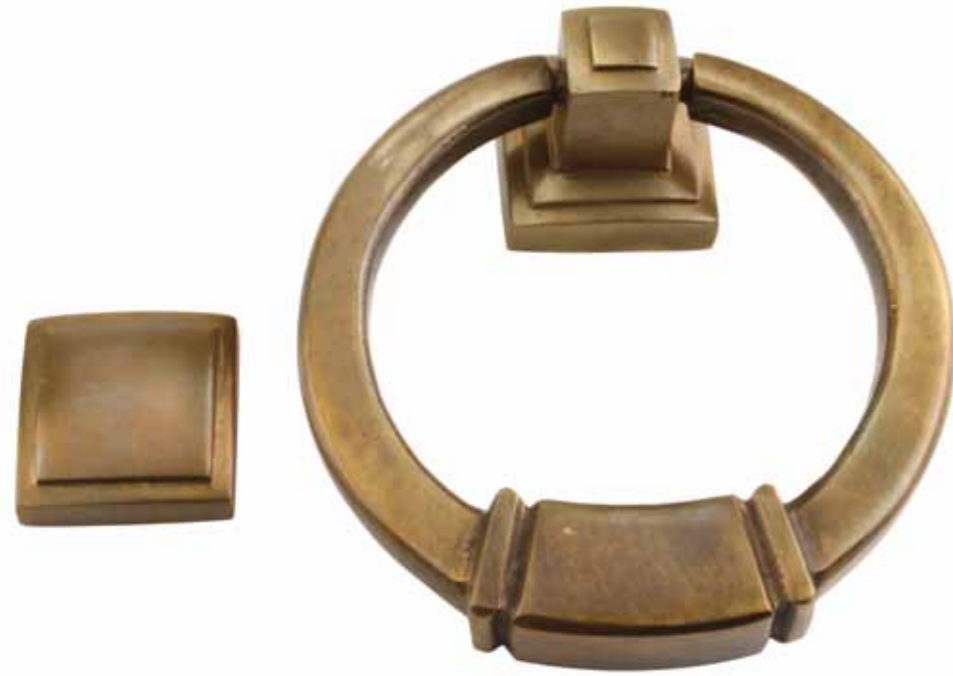
763 Square Door Knocker 98mm dia Available in all finishes