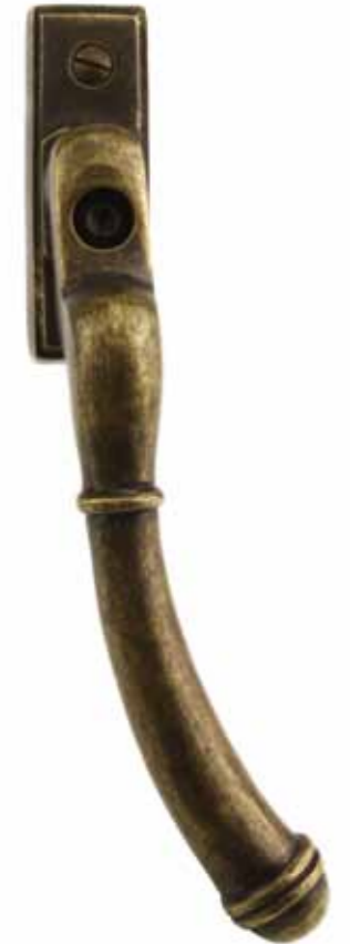
792 Ribbed Espagnolette Fastener Overall length 168mm, back plate 65mm x 22mm 43mm screw centres, 7mm spindle (handed - right hand shown) Available in all finishes