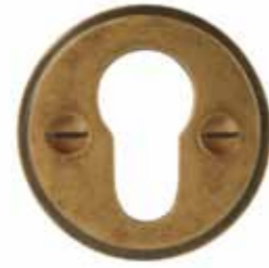
812 Round Euro Escutcheon 50mm dia Available in all finishes