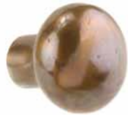
801 / 802 Round Cabinet Knob 801 30mm dia 802 40mm dia Available in all finishes