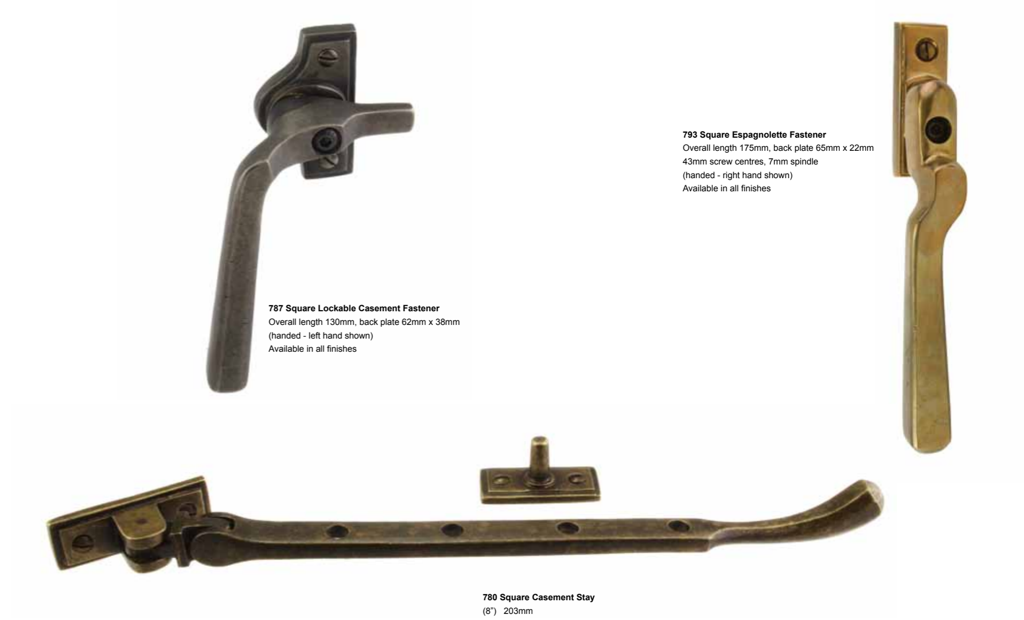
787 Square Lockable Casement Fastener Overall length 130mm, back plate 62mm x 38mm (handed - left hand shown) Available in all finishes