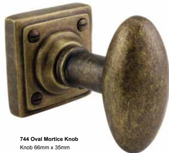
744 Oval Mortice Knob Knob 68mm x 35mm Square rose 55mm sq Available in all finishes