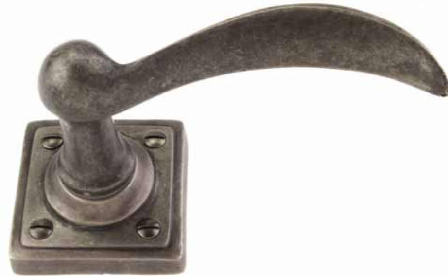
710 Curved Lever Handle Rose 55mm Sq, handle 115mm Available in all finishes