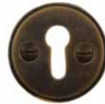
759 Round Standard Escutcheon 42mm dia Available in all finishes