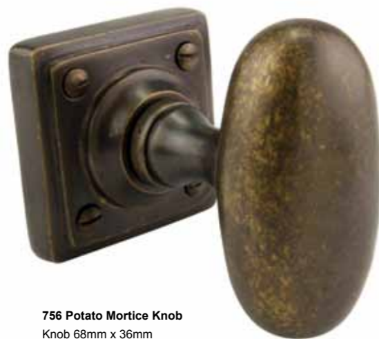
756 Potato Mortice Knob Knob 68mm x 36mm Square rose 55mm sq Available in all finishes