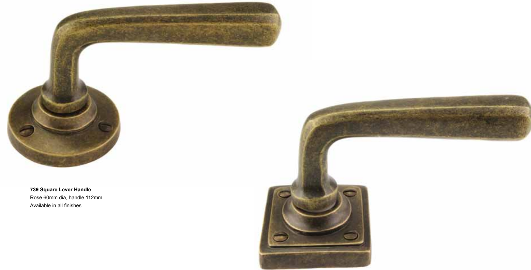
739 Square Lever Handle Rose 60mm dia, handle 112mm Available in all finishes