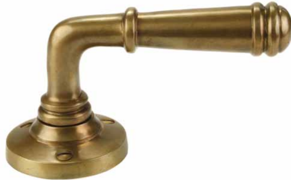
719 Ribbed Lever Handle Rose 60mm dia, handle 115mm Available in all finishes