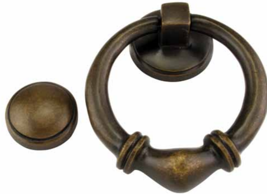
764 Ribbed Door knocker 95mm dia Available in all finishes