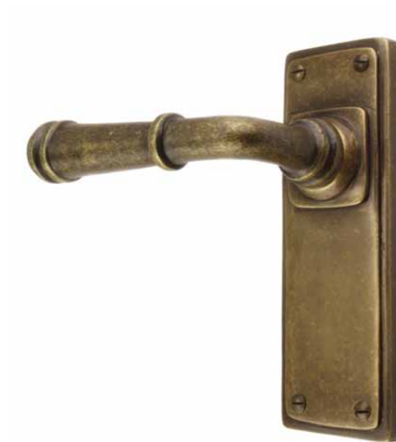
711 Ribbed Lever Handle Plate latch, lock or privacy 150mm x 50mm, handle 115mm Available in all finishes