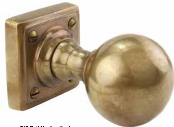
742 Ball Mortice Knob Knob 47mm dia Square rose 55mm sq Available in all finishes