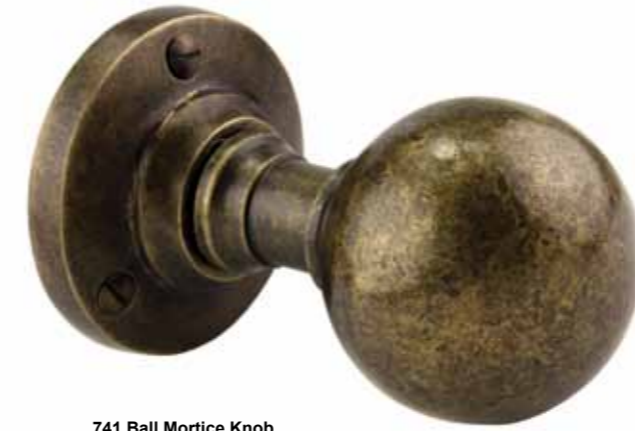
741 Ball Mortice Knob Knob 47mm dia Round rose 60mm dia Available in all finishes