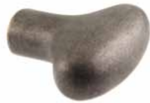
803 / 804 Potato Cabinet Knob 803 30mm dia 804 40mm dia Available in all finishes