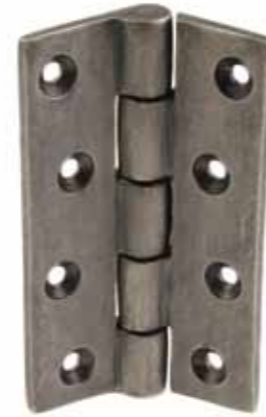
811 / 814 Butt Hinge 811 (4") 100mm x 60mm 813 (3") 76mm x 58mm Available in all finishes