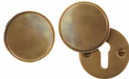
760 Round Escutcheon (covered) 42mm dia Available in all finishes