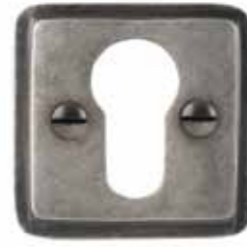
813 Square Euro Escutcheon 50mm sq Available in all finishes