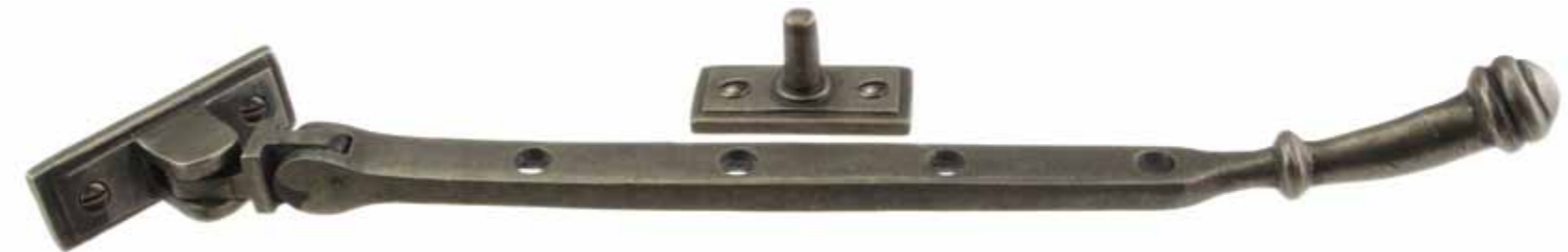
777 Ribbed Casement Stay (8") 203mm (10") 254mm (12") 305mm Available in all finishes