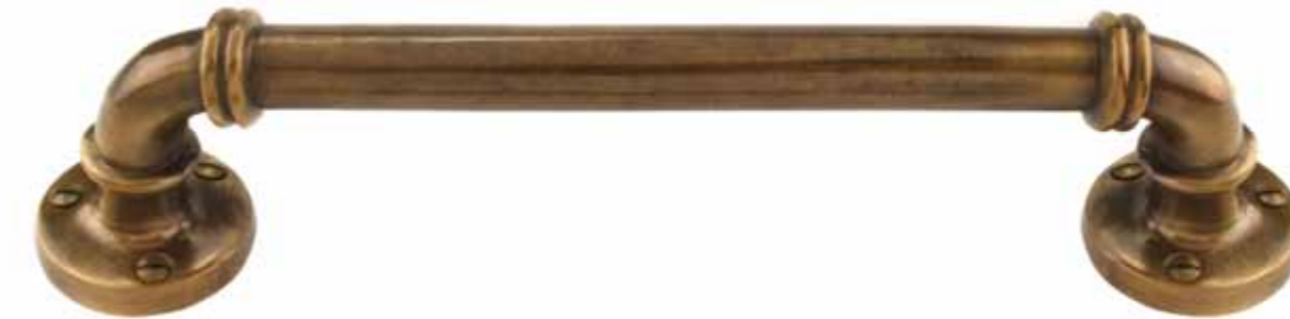
769 Ribbed Pull Handle (9") 228mm (12") 305mm Available in all finishes