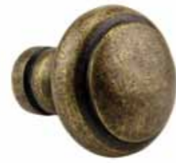
809 / 810 Stepped Cabinet Knob 809 30mm dia 810 40mm dia Available in all finishes