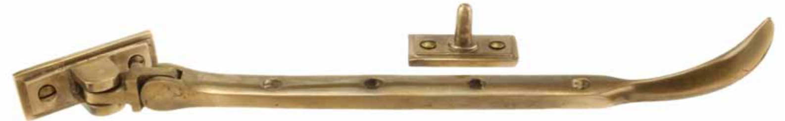
774 Curved Casement Stay (8") 203mm (10") 254mm (12") 305mm Available in all finishes