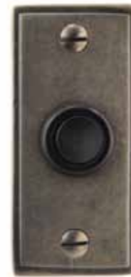
773 Bell Push 70mm x 32mm Available in all finishes