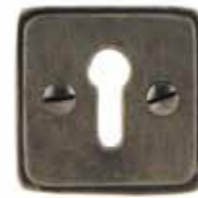
761 Square Standard Escutcheon 40mm sq Available in all finishes