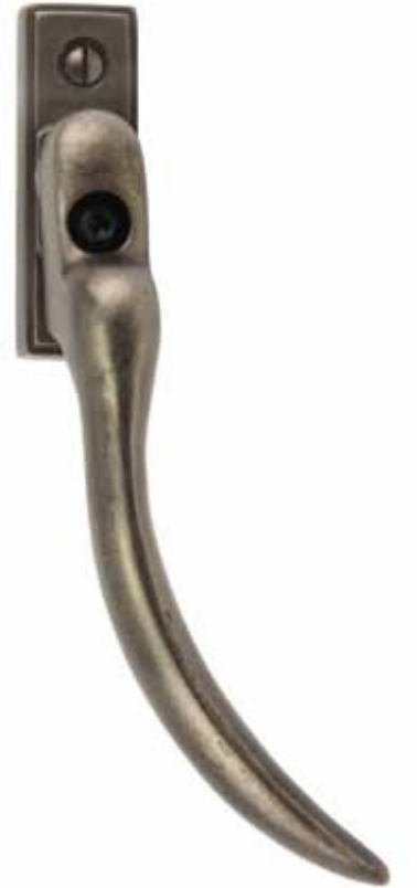
790 Curved Espagnolette Fastener Overall length 162mm, back plate 65mm x 22mm 43mm screw centres, 7mm spindle (handed - right hand shown) Available in all finishes