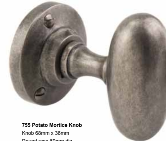
755 Potato Mortice Knob Knob 68mm x 36mm Round rose 60mm dia Available in all finishes