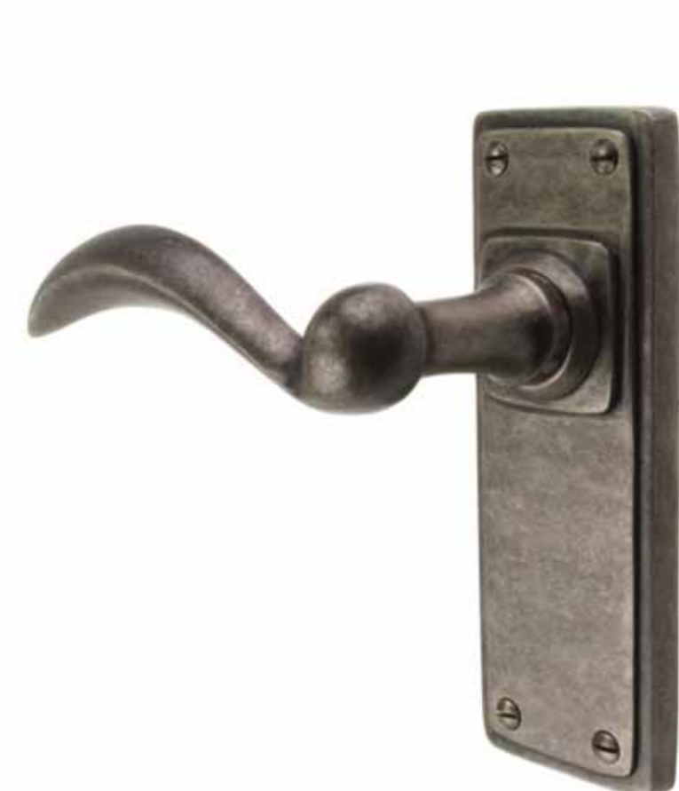
701 Curved Lever Handle Plate latch, lock or privacy 150mm x 50mm, handle 115mm Available in all finishes