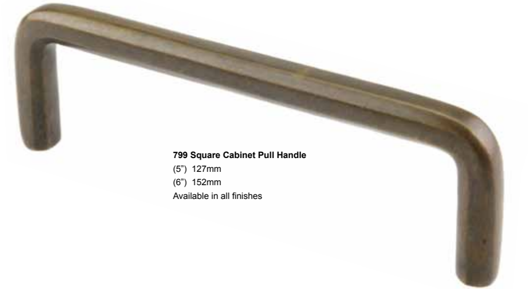
799 Square Cabinet Pull Handle (5") 127mm (6") 152mm Available in all finishes