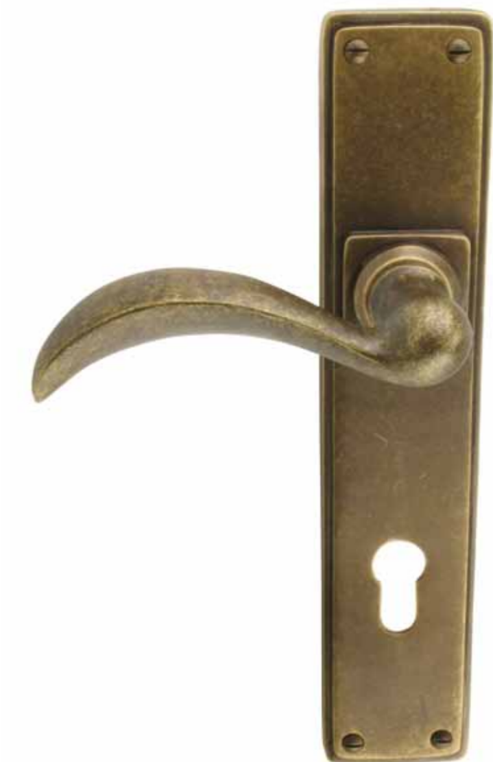
708 Curved Lever Handle Plate, latch, lock 252mm x 50mm, handle 115mm available in 70mm & 92mm ctrs (un-sprung) 72mm ctrs (sprung) Available in all finishes