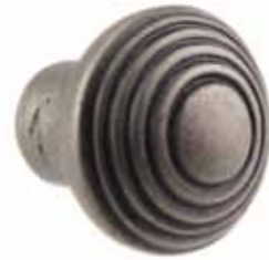
807 / 808 Ribbed Cabinet Knob 807 30mm dia 808 40mm dia Available in all finishes