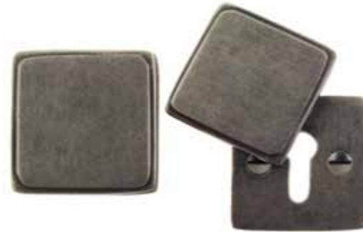
762 Square Escutcheon (covered) 42mm sq Available in all finishes