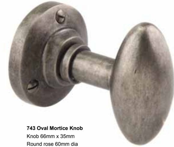
743 Oval Mortice Knob Knob 66mm x 35mm Round rose 60mm dia Available in all finishes