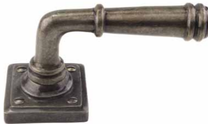
Satin Pewter Bronze