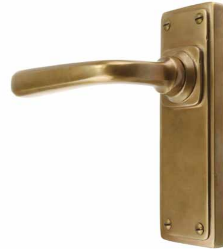
721 Square Lever Handle Plate latch, lock or privacy 150mm x 50mm, handle 112mm Available in all finishes