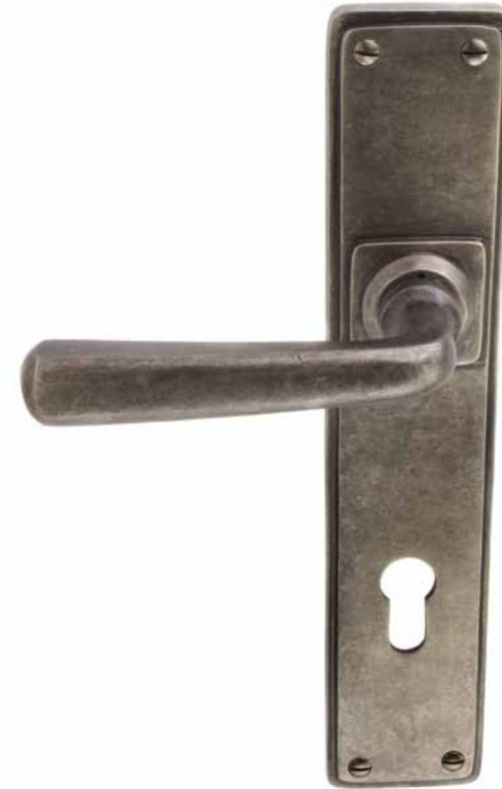
738 Square Lever Handle Plate, latch, lock 252mm x 50mm, handle 112mm available in 70mm & 92mm ctrs (un-sprung) 72mm ctrs (sprung) Available in all finishes