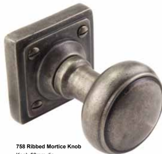
758 Ribbed Mortice Knob Knob 50mm dia Square rose 55mm sq Available in all finishes