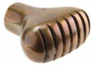
805 / 806 Slotted Potato Cabinet Knob 805 30mm dia 806 40mm dia Available in all finishes