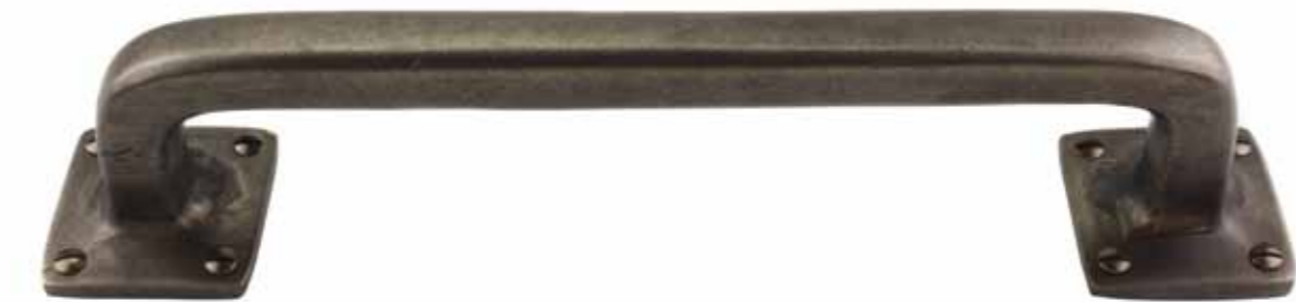
771 Square Pull Handle (9") 228mm (12") 305mm Available in all finishes