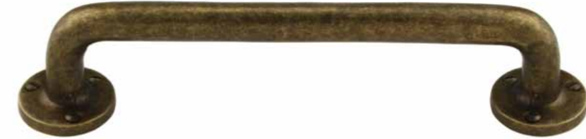
767 Round Pull Handle (9") 228mm (12") 305mm Available in all finishes