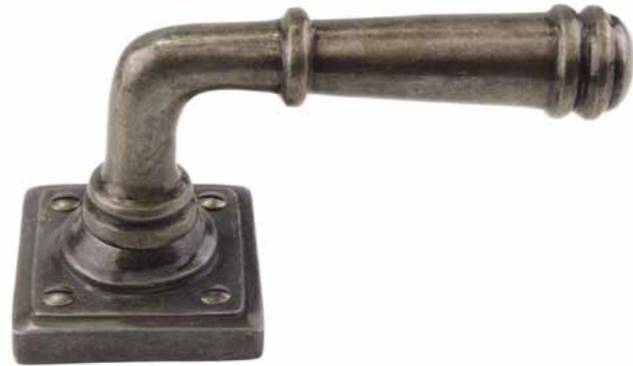
720 Ribbed Lever Handle Rose 55mm Sq, handle 115mm Available in all finishes