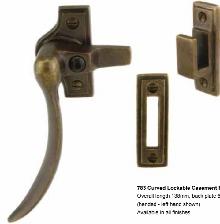
783 Curved Lockable Casement Fastener Overall length 138mm, back plate 62mm x 38mm (handed - left hand shown) Available in all finishes