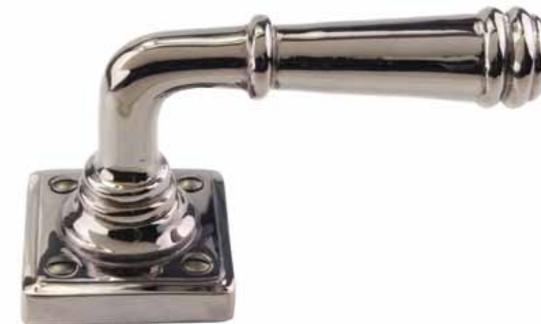
Polished Nickel Bronze