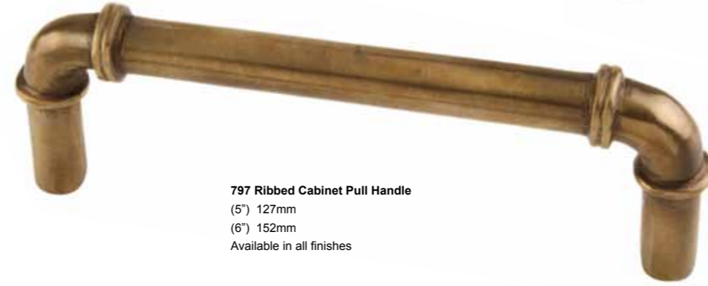
797 Ribbed Cabinet Pull Handle (5") 127mm (6") 152mm Available in all finishes