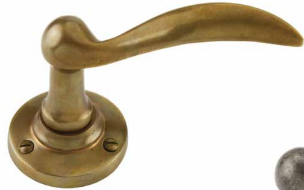
709 Curved Lever Handle Rose 60mm dia, handle 115mm Available in all finishes