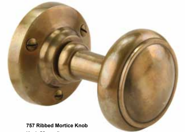
757 Ribbed Mortice Knob Knob 50mm dia Round rose 60mm dia Available in all finishes