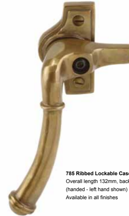
785 Ribbed Lockable Casement Fastener Overall length 132mm, back plate 62mm x 38mm (handed - left hand shown) Available in all finishes