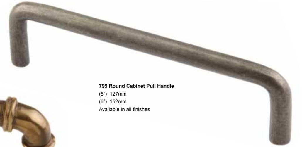
795 Round Cabinet Pull Handle (5") 127mm (6") 152mm Available in all finishes