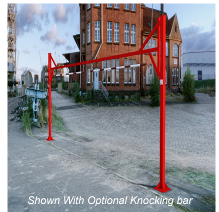
Shown With Optional Knocking bar

The standard clearance is 2.05m with a knock bar, 2.2m without a knock bar.