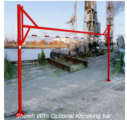
Shown With Optional Knocking bar

The AUTOPA Double Swing Height Restrictor has a standard clearance of 2.05m, limiting access to high sided vehicles. Ideal for use on commercial sites such as retail parks, it spans two carriageways, preventing vehicles from circumnavigating access control measures. The booms of the height restrictor can be opened when required to allow full access and locked in the open position if needed using additional catch posts.