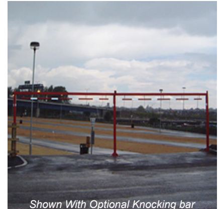
Shown With Optional Knocking bar

The AUTOPA Double Fixed Height Restrictor limits access to high sided vehicles and is perfect for use on commercial and industrial sites. The double height restrictor spans two carriageways, preventing vehicles from circumnavigating access control measures.