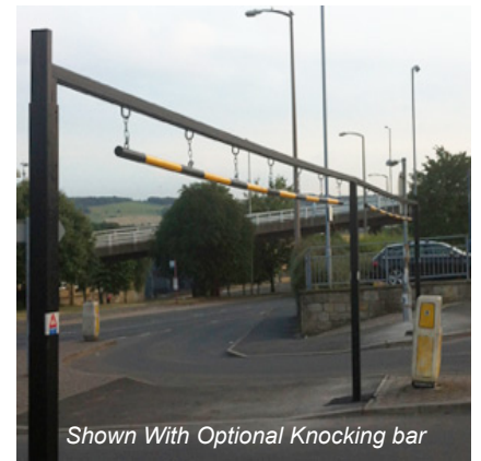
Shown With Optional Knocking bar

The standard clearance is 2.05m with a knock bar, 2.2m without a knock bar.