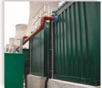
HiPAF Transportable plants installed at a power station