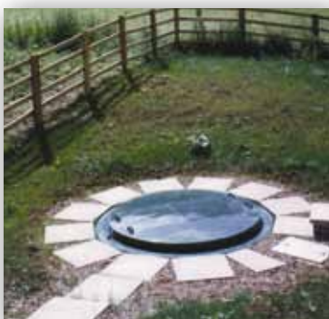
HiPAF Compact plant, below ground installation