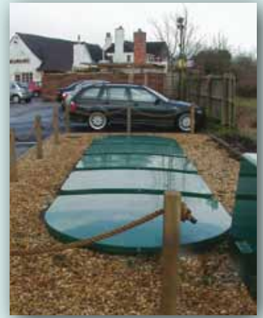
HiPAF Midi plant installed at a rural public house

WPL Limited offers a complete turnkey service via its preferred contractor network including an initial site survey.