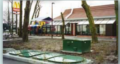
HiPAF Midi installed at an out of town fast food restaurant (below)