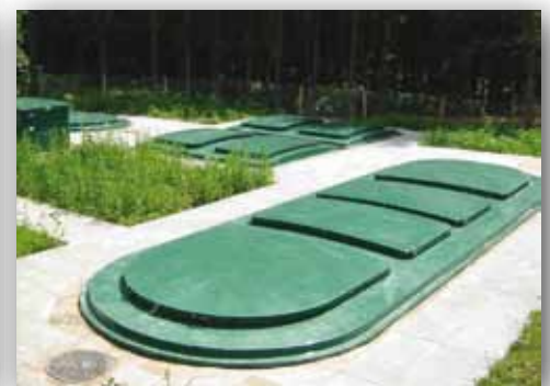
HiPAF Modular plant with kiosk and separate primary, biological and secondary tanks for larger works