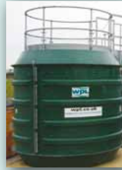
HiPAF Compact installed above ground (left)