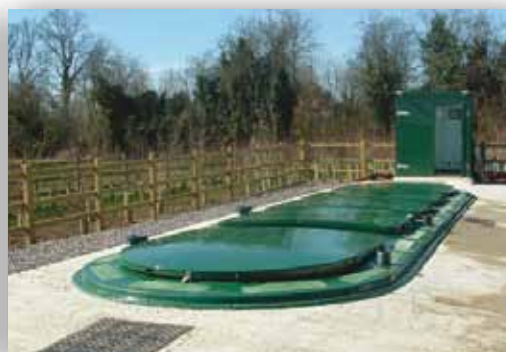
HiPAF Midi Plant with control kiosk