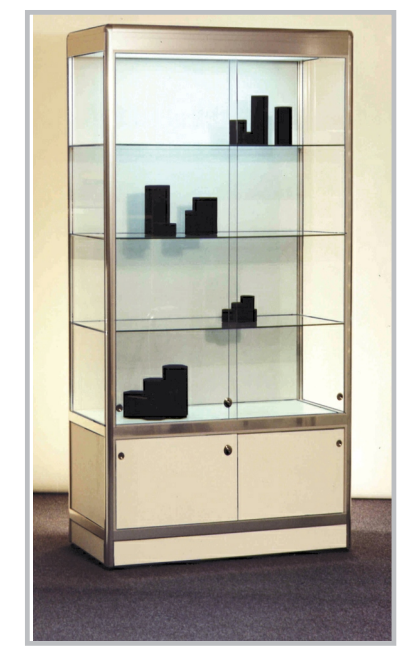
SD 3100 with optional canopy