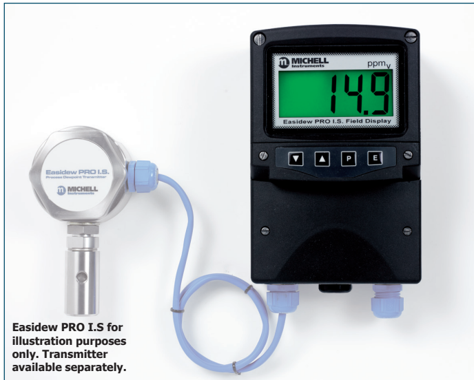
Easidew PRO I.S. for illustration purposes only. Transmitter available separately.

The Intrinsically Safe Field Display is a 4-digit loop-powered local monitor for the Easidew PRO I.S. and Easidew I.S. transmitters. It is certified with ATEX, IECEx, UKCA and FM and housed in an IP66 enclosure with a terminal compartment for wiring. The measurement unit can be labelled as ppm v , ppm w , °C dp or °F dp.