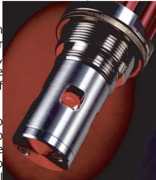
Optional 316 SS sensor housing for applications with high corrosives

For the same great features of the Optidew in a laboratory package, take a look at the Optidew Vision, which is supplied in a bench-mount enclosure with optional panel mounting kit.