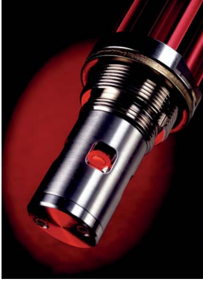
Optional 316 SS sensor housing for applications with high corrosives

Both high temperature (up to +130^{\circ}C (+266^{\circ}F)) and high pressure (up to 250 barg / 3626psig) sensor versions available. To respond quickly to rapidly changing environmental conditions Michell can also offer a special climatic sensor with a low thermal mass, ideal for climatic chamber applications.