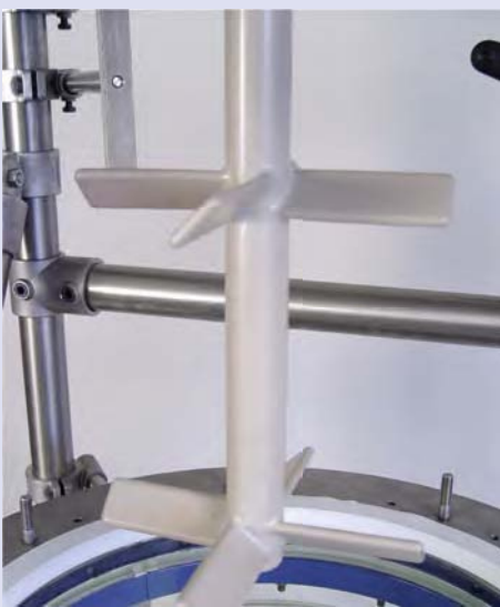
Various stirrer shapes and materials