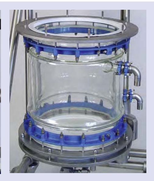
Heating / Cooling jacket