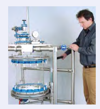
2-step lowering device