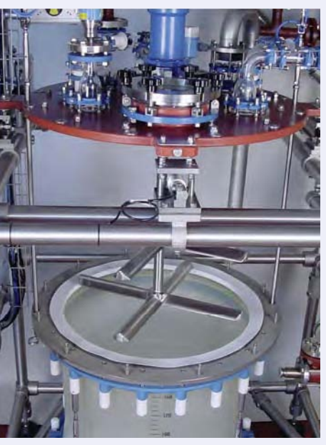
150 I solidphase reactor with filter, stirrer and load cells