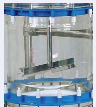
Height adjustable stirrer for optimal losening, pressing and flattening of filter cake