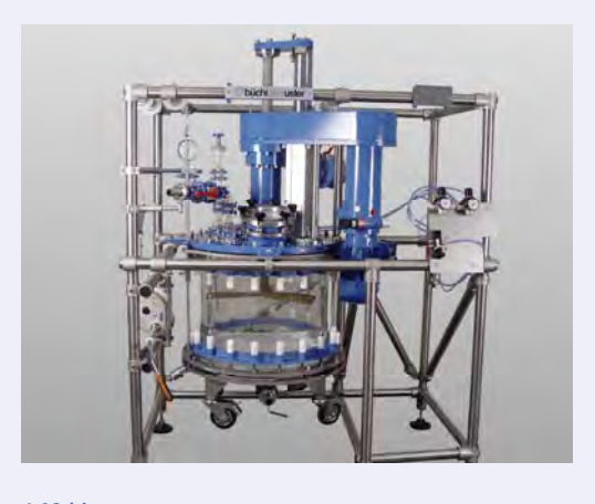
10 Litre 30 Litre 50 Litre