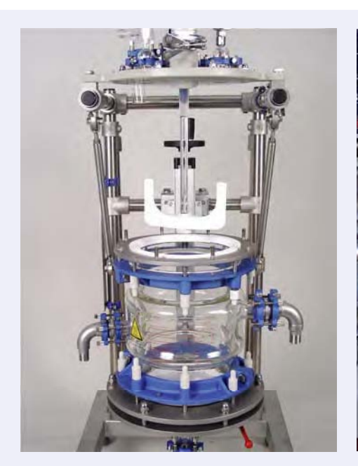
5l miniSolidphase reactor / filter, with heating jacket and anchor stirrer in glass / PTFE