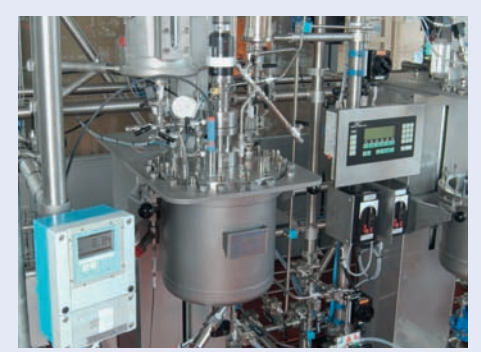
Control of suspension-polymerisation