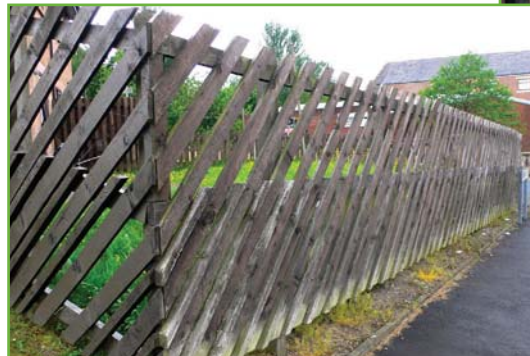
Before installation of recycled plastic fencing and after.

Kedel fencing makes architecturally pleasing boundaries with the add-on benefits of long life and no painting or staining. It's becoming an increasingly favoured option to transform local communities with organisations such as local authorities and housing associations.