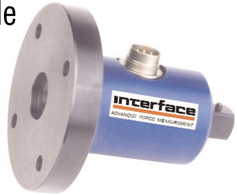
TS16 Square Flange Style Reaction Torque Transducer