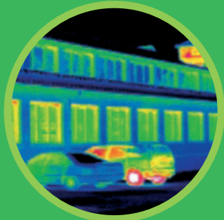
Warm Edge Windows showing virtually no heat loss.