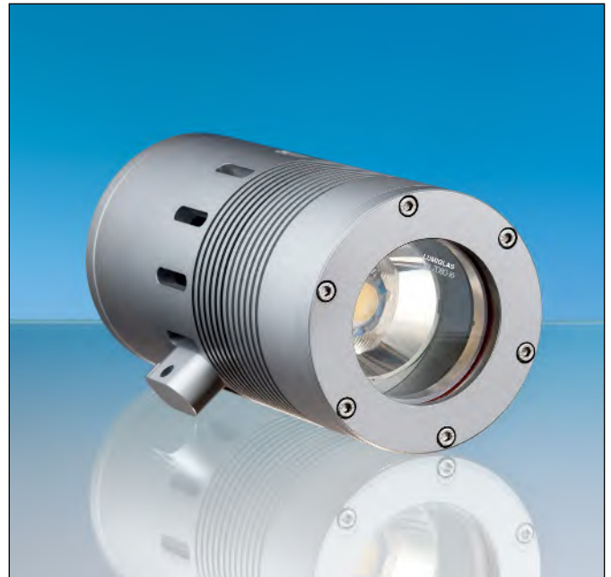
Lumistar luminaire ASL57LED-Ex, variant I