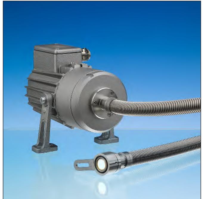
Lumistar luminaire Lumiflex USL 07 ALF-Ex

• Convenient electrical connection via integrated terminal box; cable entry gland M20 x 1.5