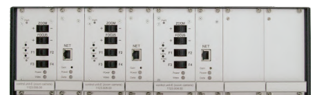
6-camera rack equipped with three camera modules and three video servers