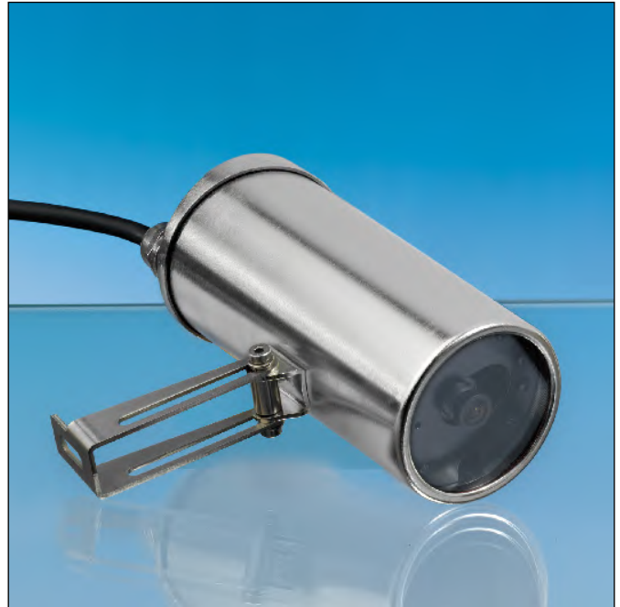
VISULEX Camera K15ZP-E with zoom lens