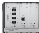
Single-camera rack with video server