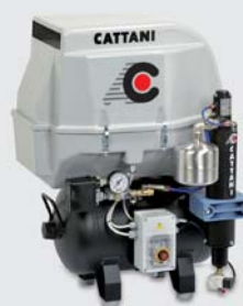
Noise reducing hood

AC1800 and larger systems, it is recommended that you sound proof the room.