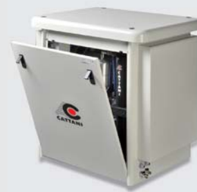
Noise reducing cabinet Product Code: 010800