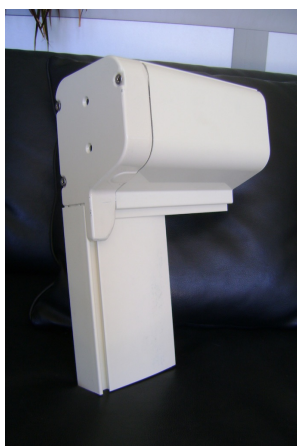
Cassette ceiling and wall fitting