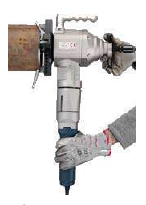
SUPERBOILER T5 E