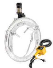
Motorized Kit (200CE)