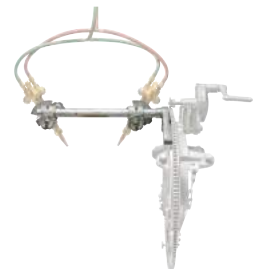
Double Cut Torch Holder* (283A)