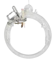
Out-of-Round Attachment* (281A)