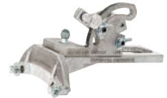
Classic Torch Holder* (4KB)