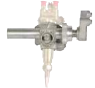
Adjustable Torch Holder* (284A)