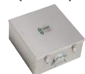
Carrying Case (13Q)

Recommended Add-Ons: ■ 528-1 Victor 14" Torch ■ \frac{9}{16} \frac{1}{2} \frac{1}{4} Wrenches ■ Cutting Tips