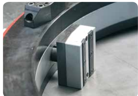
High resistance clamping pad