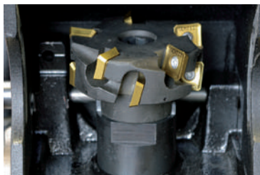
Mono block milling head, with 10 indexable inserts fixed with screws.