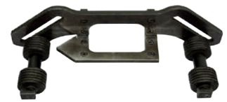
Plate facing attachment (optional)