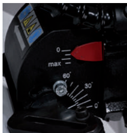
Continuous angle adjustment from 0 to 60 degrees.