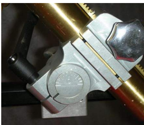
Adjustable torch holder