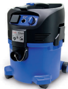
Dust Extraction Unit