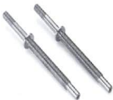
Interchangeable endless main screw: 0.2 - 0.4 - 0.6 - 0.8 mm. (0.0078 - 0.0157 - 0.0236 - 0.0314)