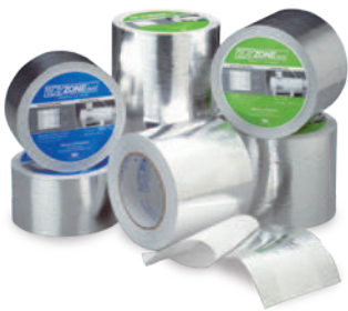
US & Foreign Patents Pending