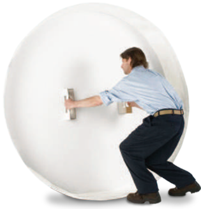
US & Foreign Patents Issued & Pending

EZ Purge® is a pre-formed, self-adhesive, water soluble purge dam that enables welders to save time on weld preparation as well as improve project timeliness. Since EZ Purge® is pre-formed; there is no need to measure, cut or construct a purge dam. Setup and installation time is completed in minutes, making EZ Purge® the most efficient and economical purge dam available.