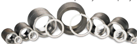
US & Foreign Patents Issued & Pending

SoluGap® Water Soluble Socket Weld Spacer Rings are made of EPA Approved Aquasol® Water Soluble Board. Dissolves completely and rapidly in most liquids. Unique tabs secure placement regardless of orientation. Compatible with any metal.