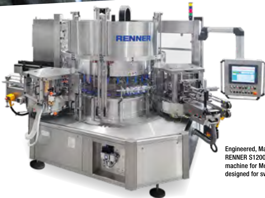
Engineered, Made in Germany: The RENNER S1200 Servo wet glue machine for Moritz Fiege is specially designed for swing-top bottles.

which was around 18 years old, recalls Marc Zinkler. In addition, the purely mechanical machine showed high wear and increasingly produced a labelling image of fluctuating to insufficient quality.