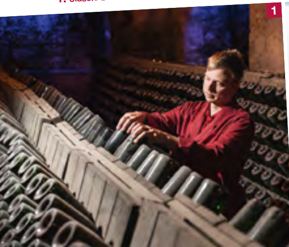
1. Classic bottle fermentation in the riddling cellar 2. Historic main building of the Rotkäppchen sparkling wine cellar 3. Red champagne cap as trademark

Want to know more about the selected solution?