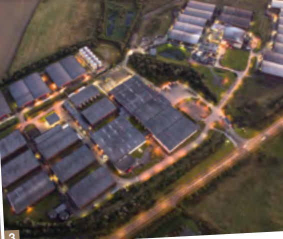
1. The Strawlaw distillery in the Lowlands 2. High quality self-adhesive labels for individual bottles 3. Evening view of the company premises