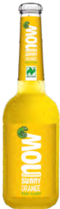
Sophisticated design: Organic lemonade brand "now" with wrap-around label on tapered bottle neck.

Organic pioneer Neumarkter Lammsbräu also wants to make labelling sustainable, and decides on RENNER as a partner for new and existing tasks.